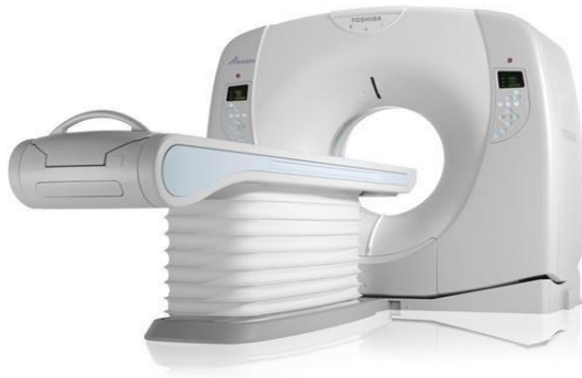
Figure (1): Toshiba Prime Aquilion 160 slice CT

Fiberoptic bronchoscopic examination: All patients included in the research were referred to the bronchoscopy unit of the Chest department, Al-Azhar University hospitals to undergo fiberoptic bronchoscopic examination with in 24 h after the CT examination using Olympus BF- 1T60 fiberoptic bronchoscope (figure 2). The route of introduction was either transnasal or transtracheal (via endotracheal tube). All patients with detected endoluminal lesions were subjected to biopsy for histopathological diagnosis.