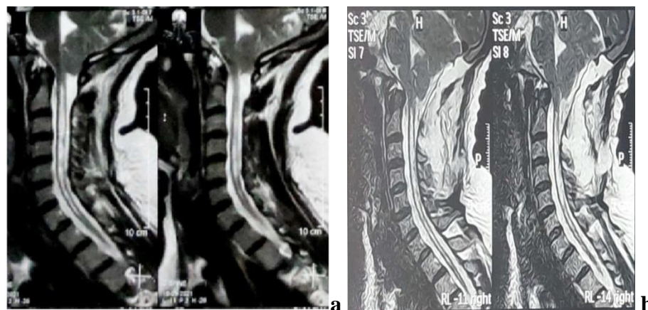
Fig. 1: a) MRI preoperative chiari type I b) postoperative using fascia lata

The majority of both groups showed marked reduction in size of syrinx (64.3% and 78.6%) without significance (Table 5).