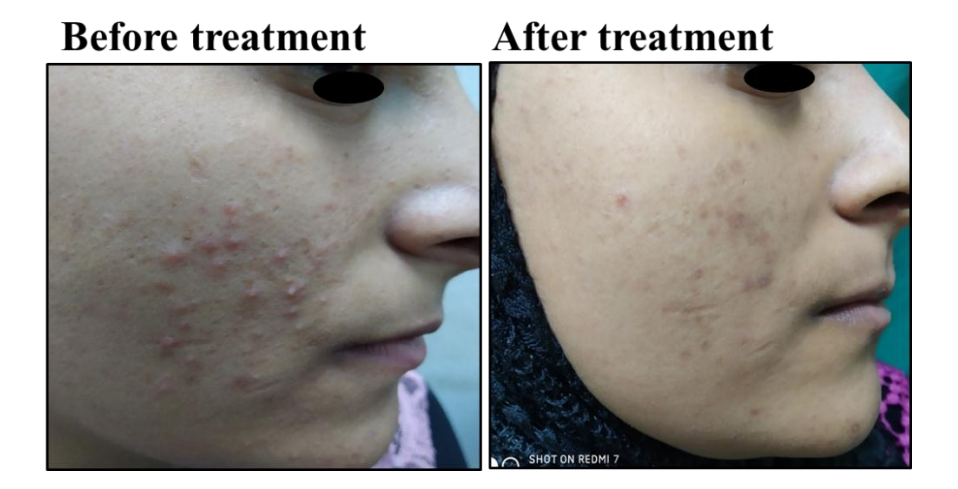
Fig. (1): excellent improvement after the treatment.

We noticed clinical improvement in most of cases which was in the form of decrease the number of non-inflammatory, inflammatory and total acne lesions after 12 weeks of treatment (fig1).