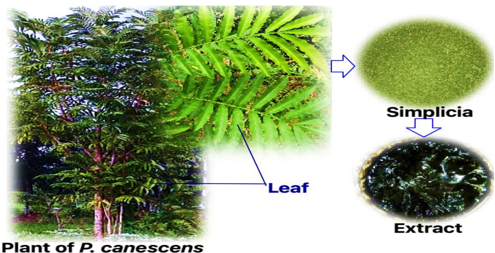
Fig. 1: Plant, simplicia powder, and extract of P. canescens .

Determination is held to ascertain the name and type of plant in a more specific way. P. canescens was determined at the Center for Plant Conservation of the Botanical Gardens of the Indonesian Institute of Sciences, Bogor, West Java, Indonesia. The determination process was conducted in March 2021.