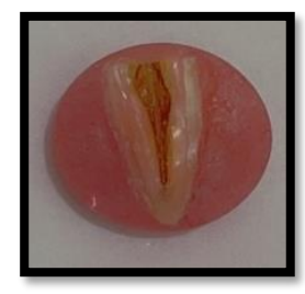
Figure (1): Showing experimental half.

longitudinal sectioning resulting in buccal and lingual halves by an isomet<sup>1</sup>. All buccal halves were considered the experimental half ( Figure 1 ), while lingual halves were considered the control half ( Figure 2 ). Each half was mounted in acrylic resin for easy material application and machine testing. Each lumen was encircled by pink wax to preserve medicament in place.