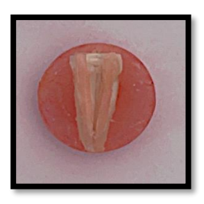
Figure (2): Showing control half.