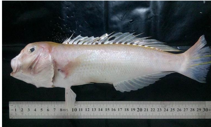
Figure 1. A photograph of Branchiostegus sawakinensis from the Red Sea.

The specimen was identified according to FAO identification sheets and the FishBase website and was preserved for further investigation. With a digital caliper, morphometric and meristic traits as well as the majority of diagnostic findings were recorded and counted.