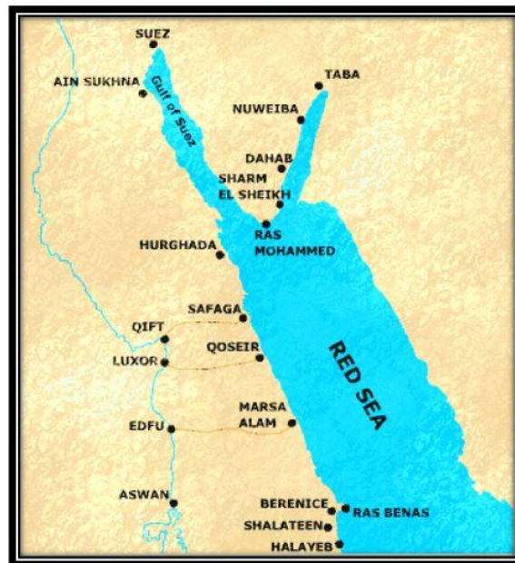
Figure 2. Map of the Egyptian sector of the Red Sea showing Hurghada fishing ground.