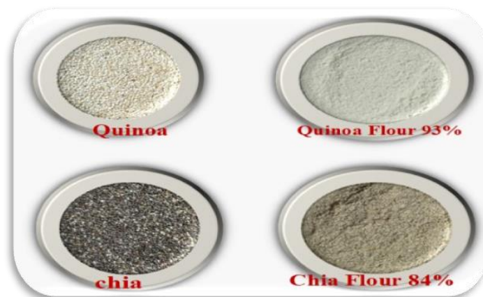
Figure (1): Photo of (quinoa and chia) seed & flour Chemicals

Wheat flour 72%, chia, quinoa seeds and the rest ingredients were obtained from Aswaq Misr market, Minia City, Minia Governorate, Egypt.