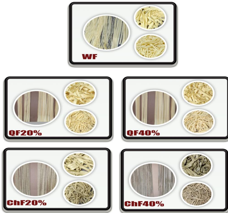
Figure (2): Photo of fresh pasta