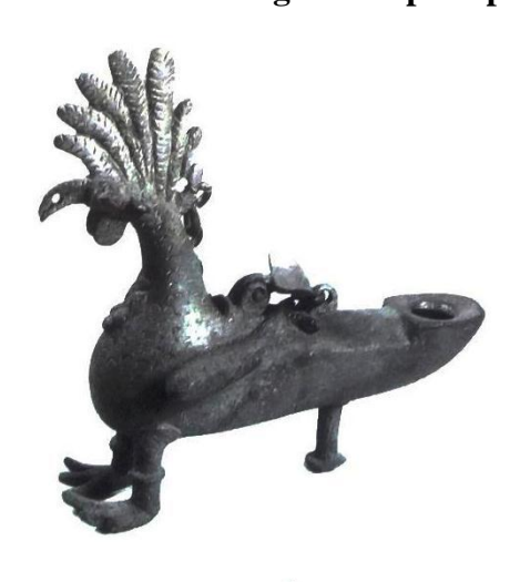
Fig. 4 Lamp shaped like a rooster