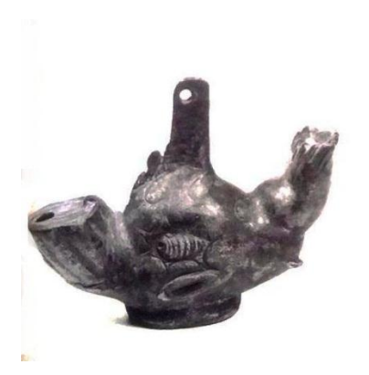
Fig. 10 Lamp