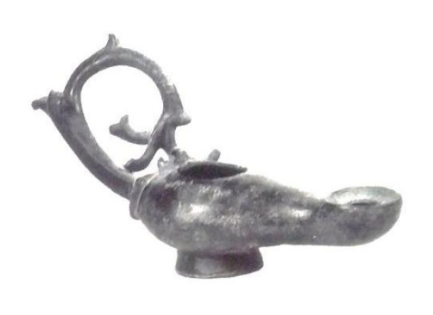
Fig. 1 Lamp