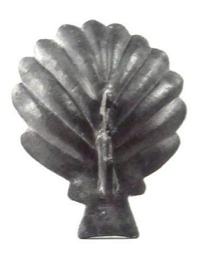
Fig. 12 Reflector of lamp