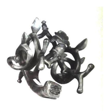
Fig. 3 Handle of lamp