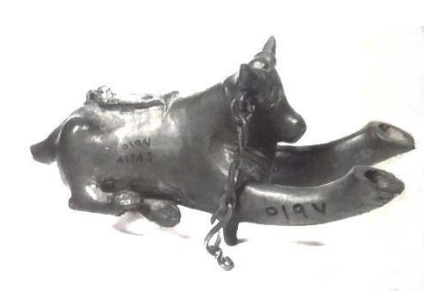
Fig. 8 Lamp