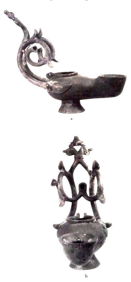
Fig. 2 Lamp