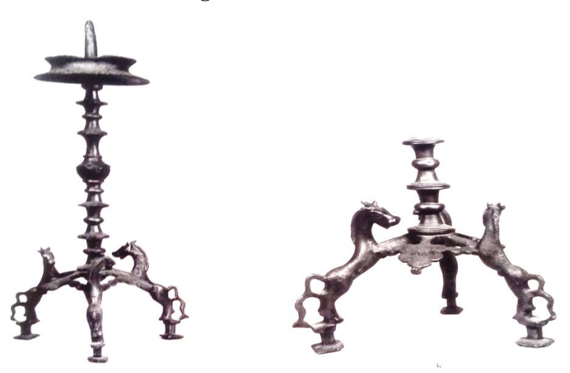
Fig. 7 A Candelabrum