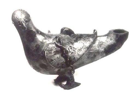
Fig. 6 Lamp