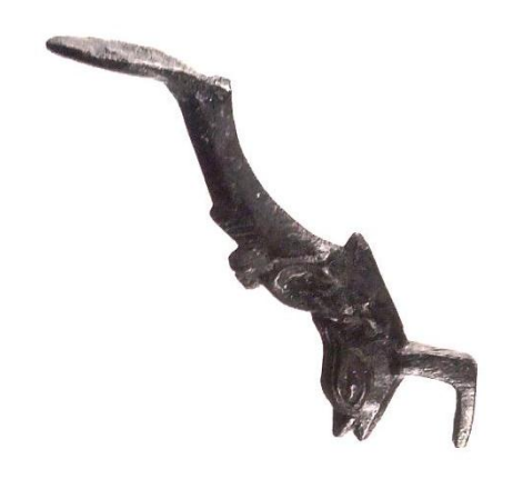
Fig. 11 Chandelier holder