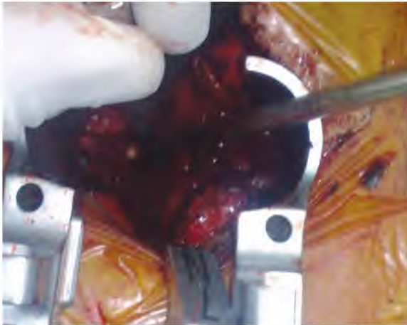
Fig. (2): Intraoperative photo for retractor used in Mini Open technique.