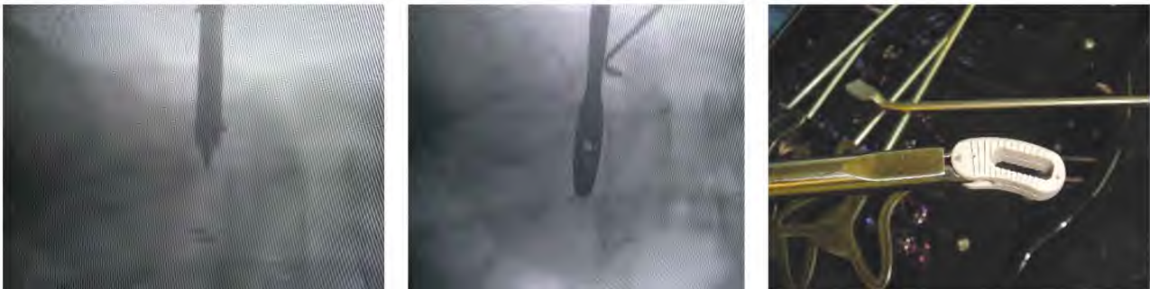
Fig. (3): Intraoperative images for cage insertion. Left: TLIF cage. Middle: Size trial. Right: After insertion of the cage.