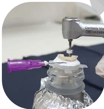
Figure (1): Experimental set-up for collection of apically extruded debris

39 extracted permanent mandibular first molars were collected. Access cavity was prepared and the mesiobuccal canal was instrumented using the ProTaper Next system up to size X2 at a working length 1mm short of the apex. Obturation was completed via the cold lateral compaction technique. Teeth were stored at 37 °C in 100% humidity for two weeks to allow the sealer to set. Then specimens were divided into three equal groups according to the system used for retreatment. Group 1: Reciproc Blue (R 25), Group2: Hyflex EDM (One file), Group 3: ProTaper Universal Retreatment system followed by X2. During retreatment, teeth were attached to an experimental model similar to that described by Myres and Montgomery.(3) Pre-weighed tubes were used to collect apically extruded debris, and a bent needle was inserted alongside the tooth, to equalize the internal and external air pressure. After retreatment, the eppendorf tubes were incubated for two weeks at 37 °C to allow all the liquid to dry out, before a second weighing for the tube after retreatment. The amount of extruded debris was calculated as the pre and post retreatment weights of the tube (W2-W1).