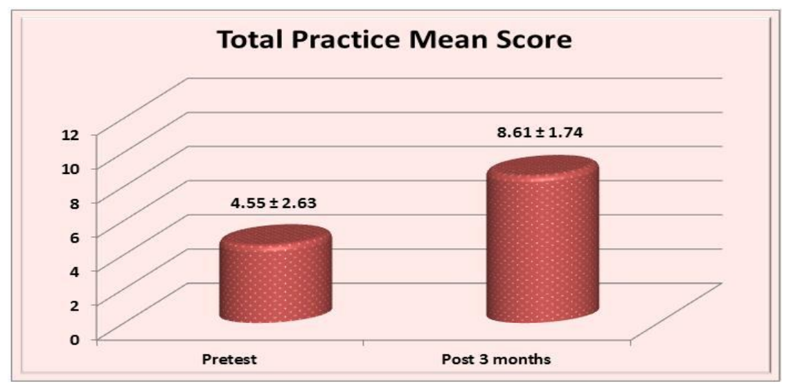
Figure (2): Mean Score of Total Practice Level of Studied Women Regarding Folic Acid Pre and Post Educational Intervention (n=100)

Figure (2): revealed that the mean score of the studied women's self-reported practice was (4.55 \pm 2.63) pre-implementing the educational intervention, and that level increased after implementing the educational intervention, as presented by mean score (8.61 \pm 1.74) after implementing the educational intervention.