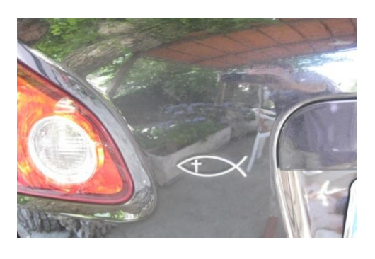
Figure 4: A Christian sign on a car.