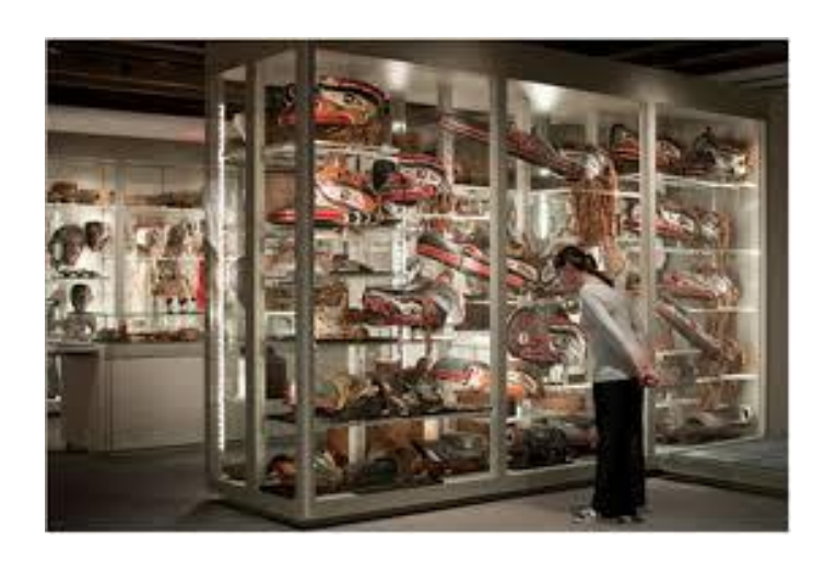
visible storage at Glenbow museum in Canada