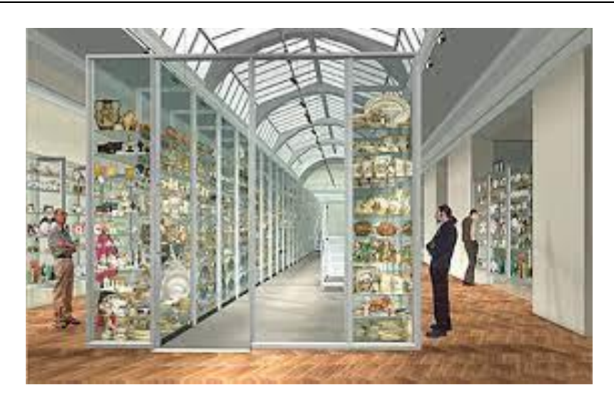
visible storage at Victoria & Albert Museum