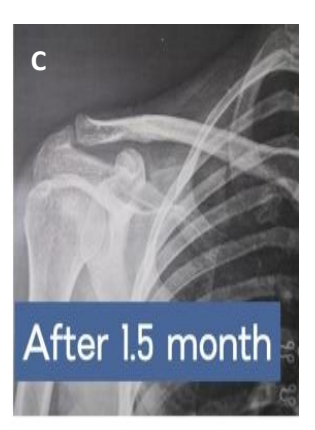
Figure 2 Male patient 35 years old, worker with Rt sided AC joint injury due to sport injury treated by screw A) preoperative x-ray finding, B) intraoperative fluoroscopy fixation show with screw. C) one and half post-operative month follow up x-ray.