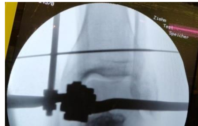
Figure 3: The reference k- wire of the knee. figure 4: the reference K- wire of the ankle