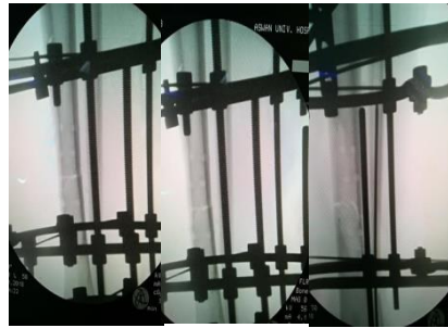
Figure 5B : intraoperative fluoroscopy shows good reduction and acceptable alignment & fixation