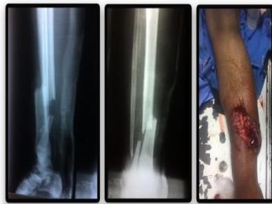
Figure 5 A : preoperative x-ray finding, OGIII A mid-shaft tibia & fibula