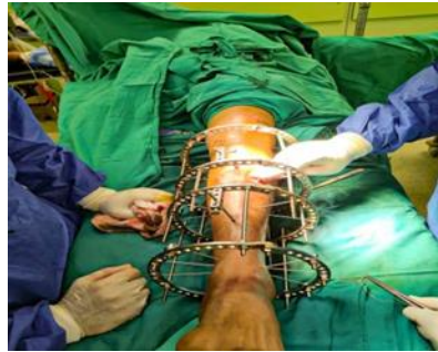
Figure 1: pre-constructed rings assembly. figure 2: Finalization of the assembly