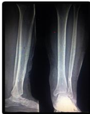
Figure 5C: Three months postoperative follow-up X-showing complete bone union