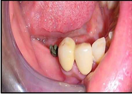
Figure (3) Crowns-attachment assembly cemented using resin cement

The crowns-attachment assembly was cemented using resin cement. Figure (3)