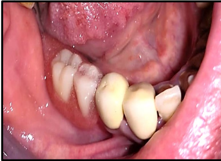
Figure (4) Finished and polished denture delivered to the patient.

Denture processing was carried out in the usual manner. The finished and polished denture was delivered to the patient. Figure (4)