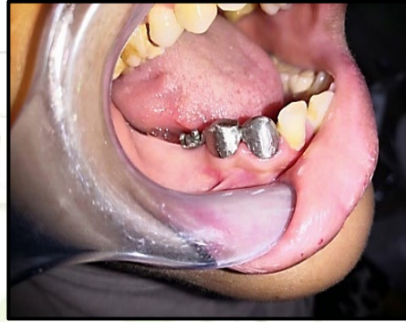
Figure (1): Finished castings tried in the patient's mouth

Spruing, investing, burnout and casting were carried out. The casting was finished except the male portion of the attachment. The finished castings were tried in the patient's mouth and checked for complete seating and proper adaptation of the finish line. Figure (1)