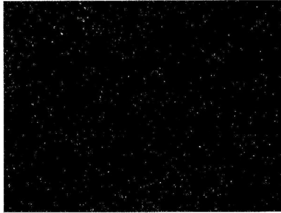
Photo. 3. Less moderate score (2+) of IBDV in the allantoic fluid and liver as detected by the direct FAT.