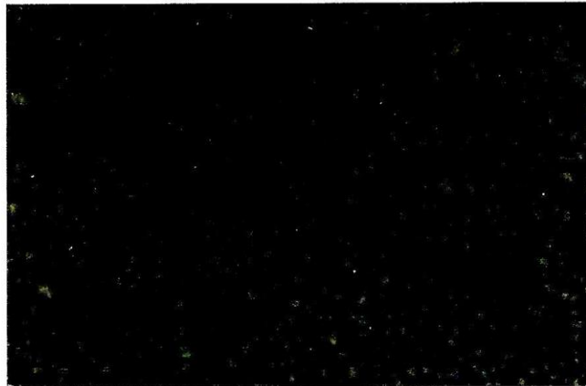
Photo. 1. High score (4+) of IBDV in the whole embryo homogenate as detected by the direct FAT. Showing clear apple green reaction.