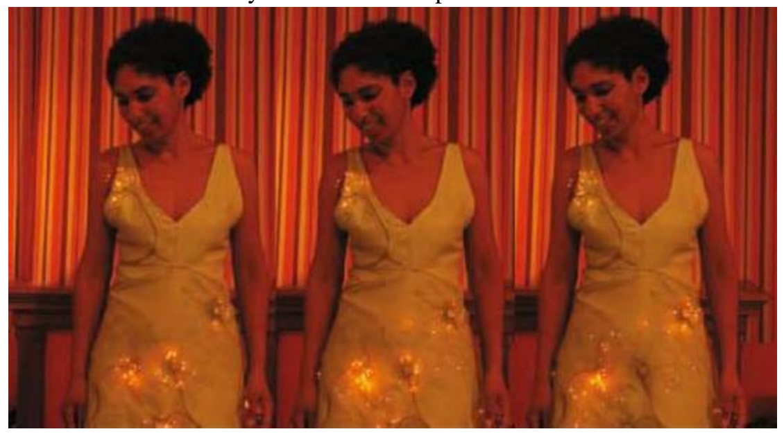
Flare (2007)SOS Design Studio, Barcelona, Spain Dress,

While there he completed a project in creating user inspired wearable electronic devices. Soon after, he joined the Swiss Federal Institute of Technology (ETH) in Zurich as a researcher on wearable computing devices. He recently moved to Barcelona. Most of his work provides a critical view on the way we relate to our products.