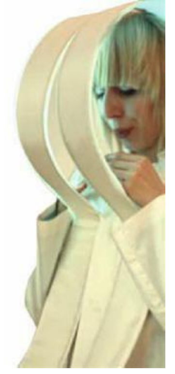
Electric Skin (2006) London, UK

EEG electrodes monitor the dreamer's brainwaves. This signal is read by a custom microcontroller circuit, which amplifies and interprets the electrical signals of the brain to control shifts of color via red, green, and blue light emitting diodes embedded in a hand-molded felt headdress. End-lit fiber optic cables transport the LED light through the headdress. This light and color becomes a visible extension of fleeting thought processes. Side-lit fiber optics carry these light impulses into the body of the garment to emphasize the distribution of thenervous system throughout the skin of the body. The design of the garment and headdress is based on the universal archetype of the tree of life.