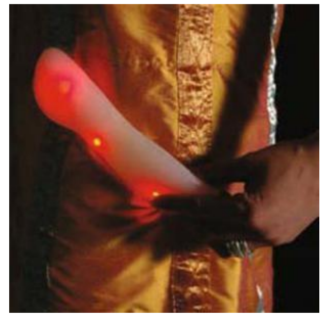
Leeches (2004), Montreal, CanadaBy Joanna Berzowska

Electronic garments, smart clothes, conductive textile, power distribution The Leeches dress, constructed with stitched conductive organza stripes, functions as a soft, wearable, and reconfigurable power-distribution substrate for attaching individual silicone-coated electronic modules (the 'Leeches') that illuminate the dress. The Leeches can be attached in a variety of positions and configurations. They are heldin place by magnetic snaps, which act both as electrical connections. single mechanical and А powermodule can be attached at the shoulder and can power up to ten Leeches. The red LEDs inside the Leeches suggest power-hungry creatures that, once attached, suck or draw power (the metaphoric 'blood') from your body. The Leeches dress provides comment on the potential dangers of electromagnetic fields emanating from electronic garments.