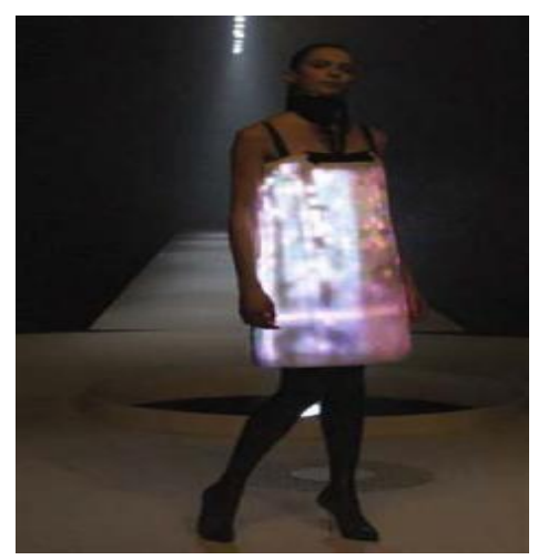
Airborne, Autumn/Winter (2007), London, UKWith Swarowski (Keywords: display, LEDs, film)

Hussein pushes the boundaries of fashion by integrating the latest LED technology into his fashion collection. The collection uses climate as a metaphor and reflects our primal feelings towards nature and the cycles of weather. An LED dress consisting of 15,600 LEDs, combined with crystal, displays short abstract films that correspond to the arrival of a particular season.