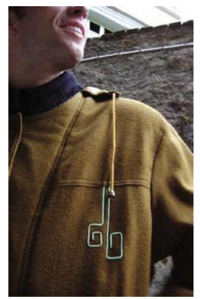
Compass Coat (2003)Interaction Institute Ivrea, ItalyWith Els Ossevoort

compass, light, orientation The Compass Coat is an extraordinary compass that indicates north by 'growing' plant shapes. In total 24 electro luminescent wires are embroidered, whichever points north starts to glow. The coat is inspired by the lack of natural elements in our urban landscape that we would ordinarily use for orientation. The Materials: wool, EL wire, magnetic resistive sensors, microchip