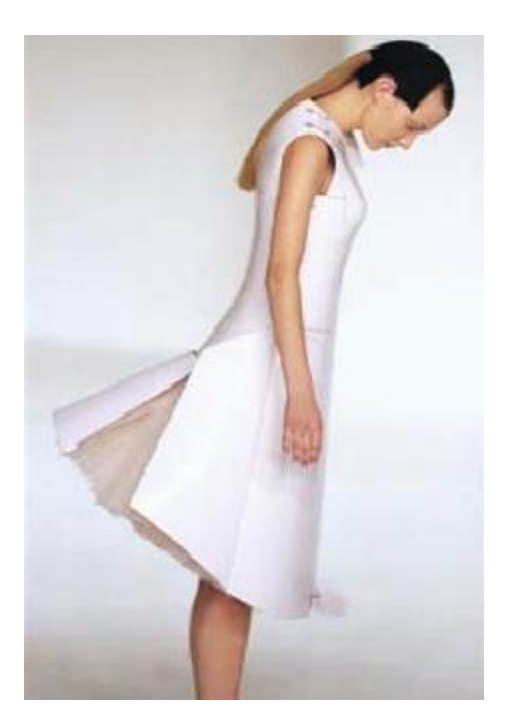
Before Minus Now, Spring/Summer (2000), London, UK, Keywords: remotecontrol, fiberglass