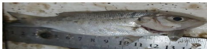
Figure 2. Two parasites on the gills of the infested C. ramada , D. labrax and C. zillii and the parasite protruded outside the gills of D. punctatus