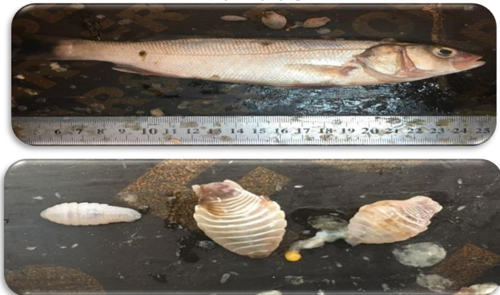
Figure 4. Different stages of growth of Livoneca redmanii (Isopoda, Cymothoidae) in gills of D. labrax in Lake Manzala during dredging operations (2019- 2021)