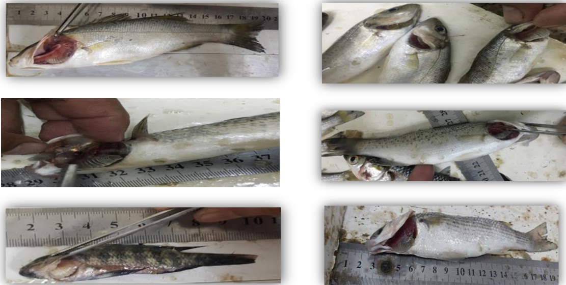
Figure 3. Different fish species Infested by Livoneca redmanii (Isopoda, Cymothoidae) collected from Lake Manzala during dredging operations (2019- 2021)

Temporally, infested D. labrax samples were recorded during all survey trips except for Winter 2021 which makes it the most frequent infected species, while infested C. zillii was the least frequent infected species as its samples were only detected during Spring 2021. Spatially, infested D. labrax and C. ramada were recorded in three different locations, (Old Boughaz of El-Gamil, New Boughaz of El-Gamil, and Tamsah for D. labrax , and Deshdy, Old Boughaz of El-Gamil, and El- Hadadya for C. ramada ), which makes them the most distributed infected species while C. zillii was the least distributed infected species as its infested samples were only detected in one location (El- Hadadya) (Table 1).