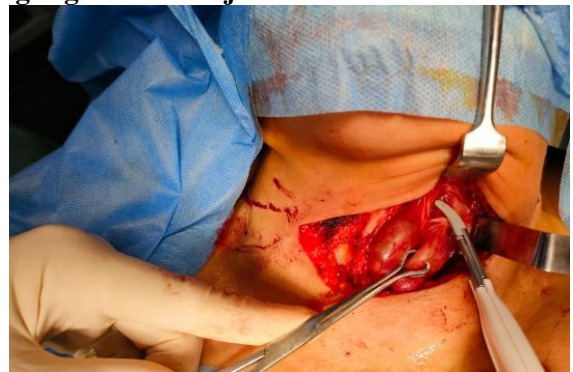
Figure (2): Sealing of superior thyroid pole and vessels using Ligasure small jaw.