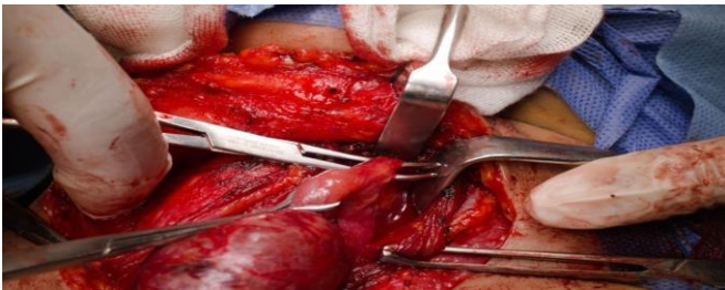
Figure (4): Exposure of the upper thyroid pole and vessels in Clamp and tie technique.