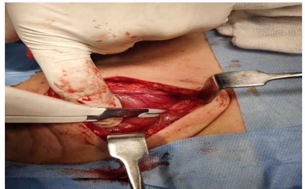
Figure (1): Sealing of middle thyroid vein (Lt. Side) using Ligasure small jaw.

Dissection of the gland from its posterior capsule was done using Ligasure with preservation of RLN and parathyroid glands.