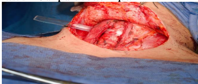
Figure (5): Ensure good hemostasis and insertion of rubber drain.