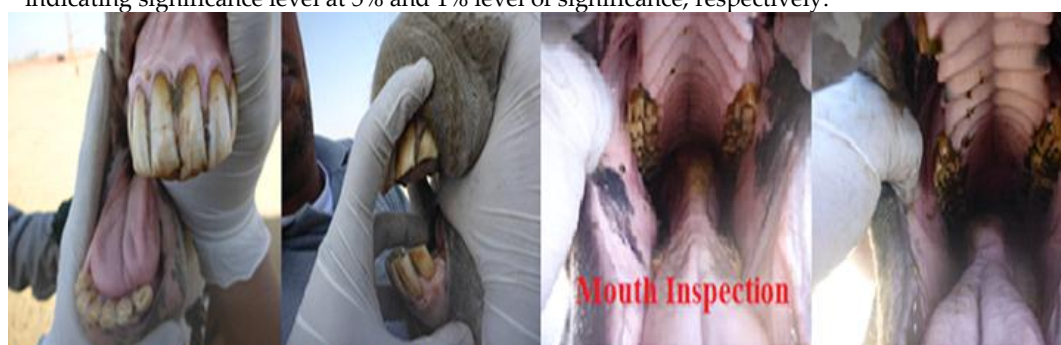
Fig. 1. Mouth physical examination

* and ** indicating significance level at 5% and 1% level of significance, respectively.