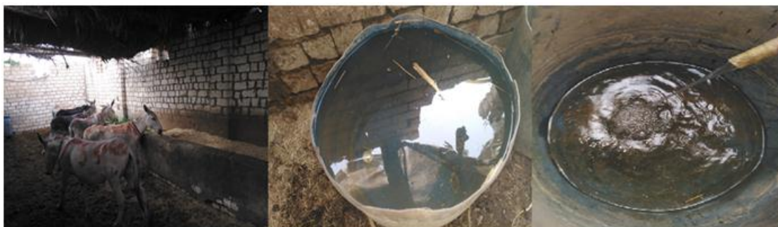
Fig. 5: Donkeys housing and drinking water source