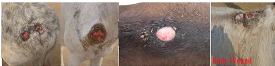
Fig.3: Different types of wounds; harness wound and beating wound