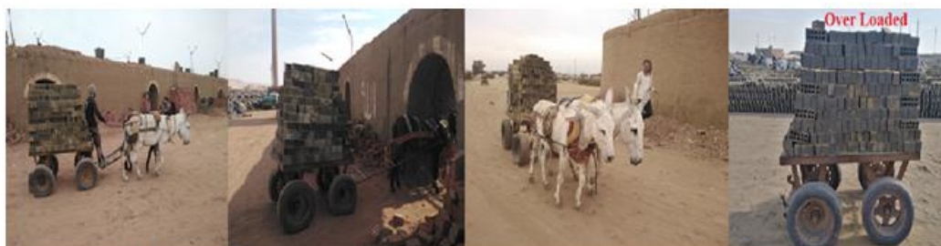
Fig. 4: Brick overloaded