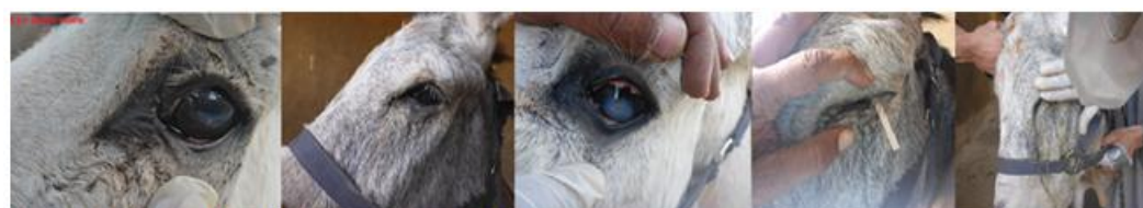
Fig.2: Eye physical examinations