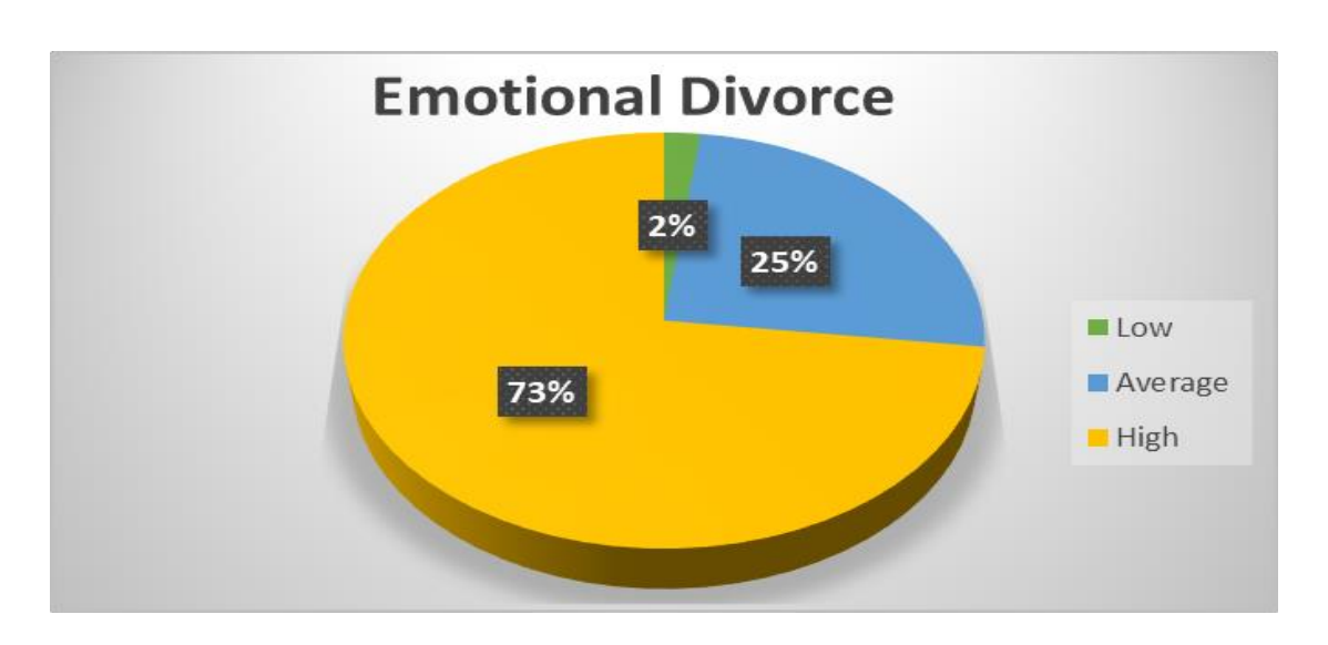
Figure 1: Percentage division of Total score of emotional divorce of considered mothers