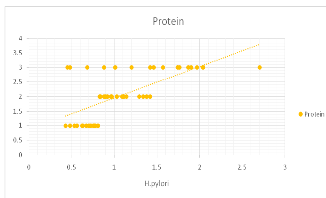
Fig. 3: Correlation between H. pylori and protein among preeclampsia group.

This figure shows that there has been a statistically significant +ve correlation across H. pylori titre and SBP and DBP among the preeclampsia group.