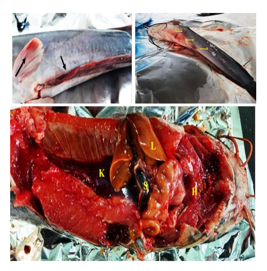
Fig. (1): Clarias gariepinus showing (A) hemorrhages on pectoral and anal fins (black arrows), (B) ulcers and macerated muscle in the flank and abdomen (yellow arrows), and mild fin erosions (black arrows), (C) enlarged liver (L), engorged spleen (S), congested kidney (K), inflamed heart (H) and distended intestine (I).

The detected isolates were 207. Liver was the highest organ harbored E.feacalis (43.5%) (Table, 5).