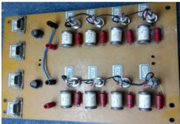
Fig 3.2a The Original TRIAC control unit