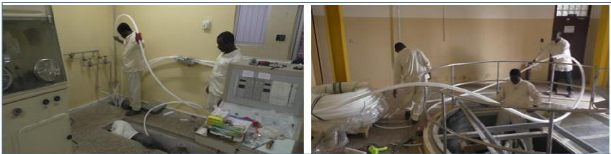
Fig. 3.1 Installation of new irradiation tubes connecting the PTS to the reactor Core.