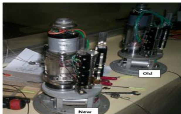
Fig. 2.4b: Old and New Control Rod Drive Mechanism

Programmes for periodic assessment based on broad operational data collection, preventive maintenance, and continuous monitoring of the control rod drive mechanism revealed that it was deviating from the normal operating condition. The procedure for its removal and replacement was prepared and approval was given by the regulatory authority. The original control rod drive mechanism was removed and a new one supplied from CIAE was replaced successfully. Figures 2.4a, and 2.4b shows respectively staff engaged in the removal of the old control rod drive mechanism and installation of the new one. Reference [5]provides detail of the procedures involved.