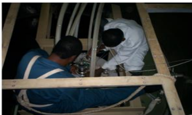
Fig. 2.4a: Staff engaged in the control rod drive mechanism replacement

As ageing brings about gradual physical degradation of SSCs, regular verification of core clad failure was put in place. By this the reactor and the pool water samples were analysed for traces of fission elements or products such as ^{131-135}\text{I} , ^{90}\text{Sr} , ^{95}\text{Zr} , ^{95}\text{Nb} , ^{137}\text{Cs} , ^{140}\text{Ba} , ^{140}\text{La} , ^{85}\text{Kr} , ^{133}\text{Xe} and ^{135}\text{Xe} . It is believed that should there be a clad failure of the reactor core, there would be fission products which will eventually “be transferred through the failed clad to the reactor water. The obtained reactor and pool water assessed for the presence of ^{137}\text{Cs} in the 8 years (1994-2011) of its utilization are presented in