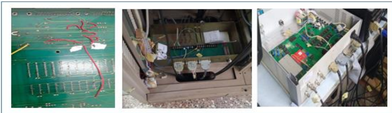
Fig. 3.0 Dry Joint, Wear & Tear conditions of Control and Instrumentation Circuit Board

Tubes installed in the Pneumatic Transfer System (PTS) for sample transfer into and out of the reactor irradiation site became weak and brittle. The old tubes which existed in operation for over 23 years were removed and new ones installed. The new tubes installed in place have the same dimensions ranging from tubes of internal diameter (mm) of 19.0, 32.0 and 16.0 and thickness of 10.0, 8.0 and 4.0 mm respectively. This was done to avoid tubes busting or breaking during reactor operation. Figure 3.1 shows pictures of staff engaged in the replacement work. Safety procedures and work orders were approved before the commencement of the work. Apart from the PTS tube replacement, the Triode for Alternating Current (TRIAC) control unit for the sample transfer system was redesigned. This came as a result of not getting the exact original component (TRAC KS3-8 87.7) in the Ghanaian local market for replacement when it malfunctioned. This issue of the non-availability of the component to buy locally made it difficult to operate the PTS. So the existing circuit was studied and a new control unit has been designed, constructed and installed using an equivalent component (BTA-16) to help do away with the obsolescence of the original TRIAC. Fig. 3.2a and 3.2b show respectively original components, TRAC KS3-8 87.7 on the circuit board and the new board with BTA 16 TRIAC.