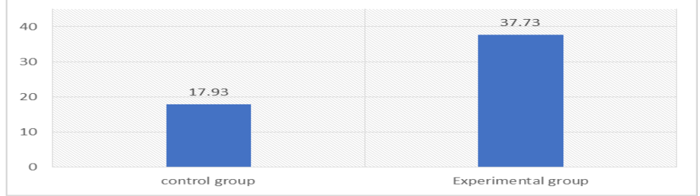
Figure (4): The Statistical Representation of the Study Participants' Mean Scores on the Post administration of the FLES

Therefore, the statistical significant difference ( \alpha \le 0.01 ) level of significance between the mean scores of the study participants of the experimental group that was taught using a program based on the expectancy-value appraisals and the control group that received regular instruction on the post administration of the FLEST in favour of the experimental group, was confirmed. In order to measure the effect size of implementing the program based on the expectancy-value appraisals on increasing first year, secondary school students' foreign language enjoyment, the value and significance of ETA square and the effect size were calculated.