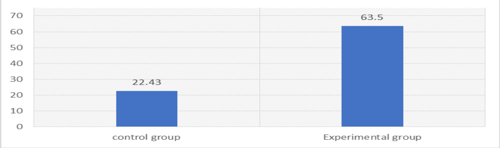
Figure (3): The Statistical Representation of the Study Participants' Mean Scores on the Post administration of the EELT

Apparently, the statistically significant difference ( \alpha \le 0.01 ) level of significance between the mean scores of the study participants of the experimental group that was taught using a program based on the expectancy-value appraisals and the control group that received regular instruction on the post administration of the EELT in favour of the experimental group, was confirmed. In order to investigate the effect size of implementing a program based on the expectancy-value appraisals on