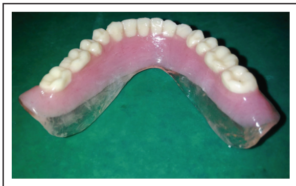
Fig. (1) The mandibular denture with the flexible lingual flanges

Before insertion of dentures with flexible lingual flanges, the mandibular denture was immersed in hot water bath (95°C) for 5 min to soften the flexible flange, so that they can be easily adjusted to adapt the undercut area of the mylohyoid ridge.