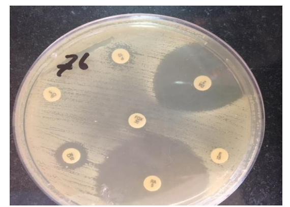
Fig. 2: Erythromycin induced clindamycin resistance in MRSA isolate.

The inducible clindamycin resistance (D zone) was observed in 3 isolates (3.9%) among MRSA as shown in figure (2).