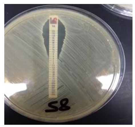
Fig. 3: MIC of Vancomycin at 4\mu g/mL.

Seventy five isolates (97.4%) were sensitive to vancomycin (VSSA) and 2 isolates (2.6%) were intermediately susceptible to vancomycin (VISA) with MIC 4 \mu g/mL as shown in figure 3.