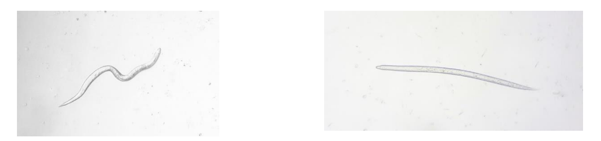
Figure 3 : Live second infective stage (J2) of M. incognita actively moving in distilled water of control treatment (left) and straight dead J2 in Virkon S treatment (right).

development with lysis eggshell and egg content flow (Fig.2). At the beginning of exposure, it was observed that some juveniles hatched successfully from a few eggs after a brief period of up to 15 minutes and showed unusual hyperactivity and excitation. After an hour from hatching, J2 die gradually and are fixed in straight shapes or other shapes, with a gradual change in color to become more transparent or shiny and reach complete transparency after their death (Fig.3). This action causes effective egg hatching reduction with a short latent period within about an hour of exposure.