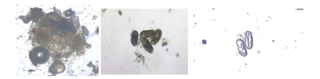
Figure 1 : Eggs of single egg mass coated with gelatinous matrix in Meloidogyne incognita (untreated control) at various stages of embryonic development (left); Virkon S could dissolve gelatinous matrix which coating RKN egg masses, resulting in small clusters of RKN eggs (3 - 4 eggs; middle); changes in eggs morphological aspects and stop development (right).

*** Significant variances are indicated by different letters in the same column ( P \le 0.05 ) using Duncan's multiple range test.