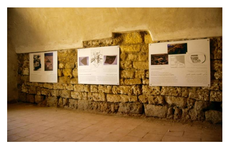
Figure 9: Heritage Interpretation at El-Quseir Fort.

The main challenge with using this kind of static interpretation which has been used in the adaptively reused El-Quseir Fort, is that it contains fixed information in terms of quantity and quality that may not be effective or suitable for the diverse range of the visitors and residents, it also doesn't enhance visitors' interest in learning, which creates a need for diverse forms of heritage interpretation to engage a wider scope of visitors and meet their expectations (Su et al., 2022), as it is advisable to use different interpretive techniques to accommodate the diverse abilities and expectations of various visitor segments. (Seccombe, P. & Lehnes, P. 2005)