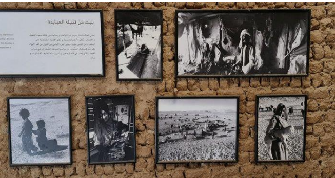
Figure 4: Pictures that showcase Ababda tribe.