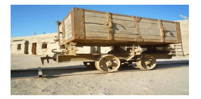
Figure 5: Phosphate truck.