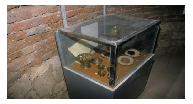
Figure 3: Archaeological objects discovered within Quseir Fort exhibited in glass case.