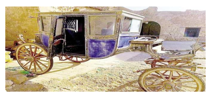
Figure 8: carriage from the reign of Abbas khedive Helmy II.

As depicted in the accompanying pictures, the project opted to present the agreed-upon themes in their most appropriate tangible form. This decision may have been influenced by the nature of these themes and the challenge of effectively presenting them in an intangible form. Consequently, the project team decided to exhibit tangible displays that are best suited to the structure of the Fort.