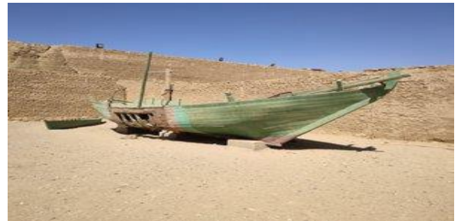
Figure 6: Locally made Boat.