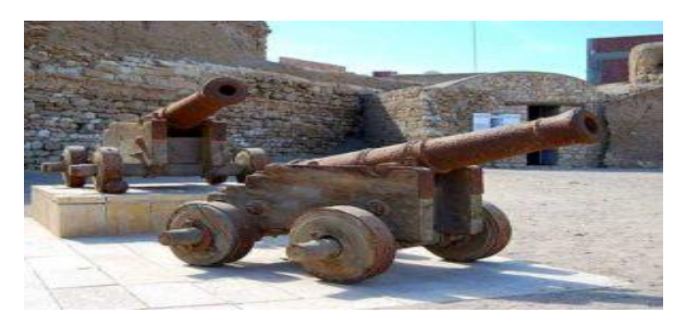
Picture 7: French Cannons.