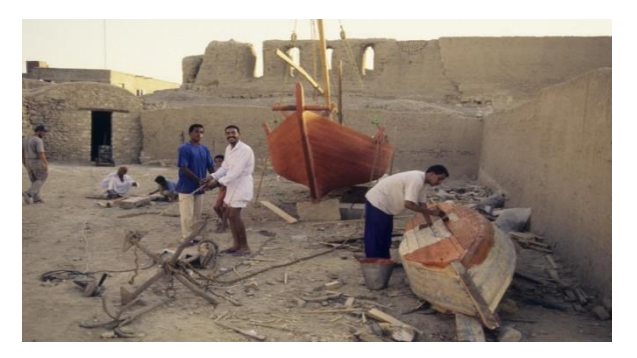
Figure 2: The Locally Made Boat while being painted by one of EL-Quseir Residents.

The community's involvement continued during the implementation phase of the project, as the conservation work was primarily carried out by local people members under the supervision of international conservators. In addition, one of the local community residents who possessed the skill for building diving Boats constructed one for the project to be exhibited in the open courtyard of the Fort. (Mallinson Architects, 1996; Rashed, A.Y. and ElAttar, M.E. 2004)