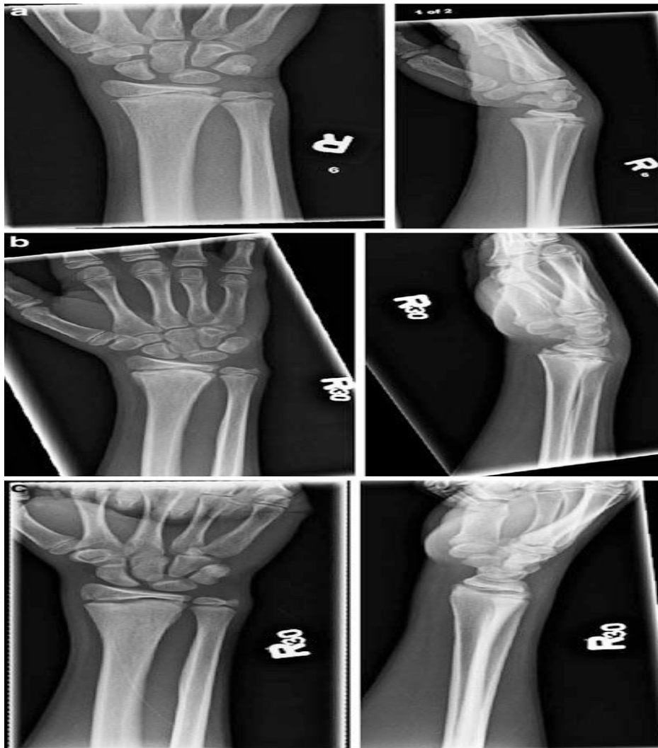
Figure (1): (a) AP and Lat. views of a Salter-Harris II fracture of the distal radius with dorsal displacement and mild angulation (b) AP and Lat. views at 6 weeks and (c) at 4 months (2) .