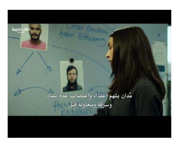
Screen Capture (2): "Caliphate", episode 2, min 6.45

Clearly, the scene is part of the encoding process as it promotes the view of ISIS as a radical Islamic movement whose sole aim is to oppress women and dominate them. This element of female oppression is an instrumental aspect of the audiovisual discourse of ISIS presented in the Netflix series. This way, Netflix guarantees that this discourse would be decoded by its transnational audience as a preferred reading, hence gaining more popularity worldwide.