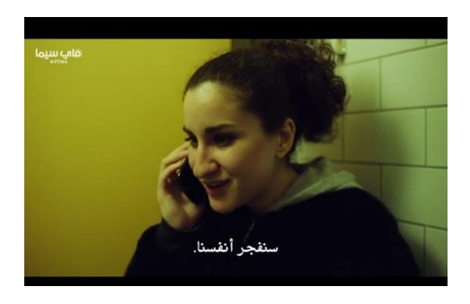
Screen Capture (12): "Caliphate", episode 8, min 47.09