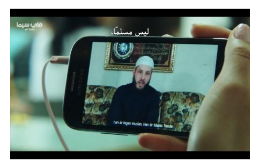
Screen Capture (7): "Caliphate", episode 2, min 12.39