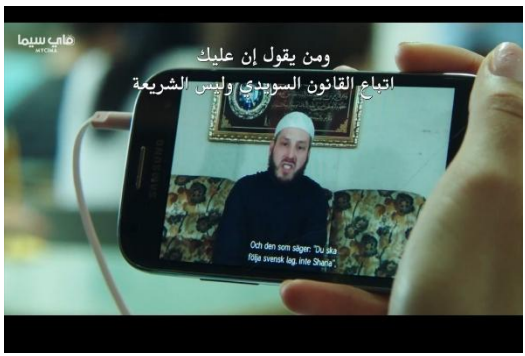
Screen Capture (6): "Caliphate", episode 2, min 12.36