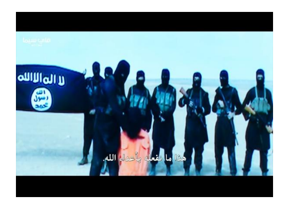
Screen Capture (5): "Caliphate", episode 4, min 38.58