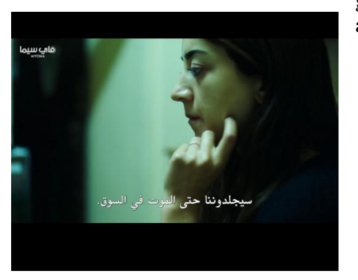
getting into afterlife.