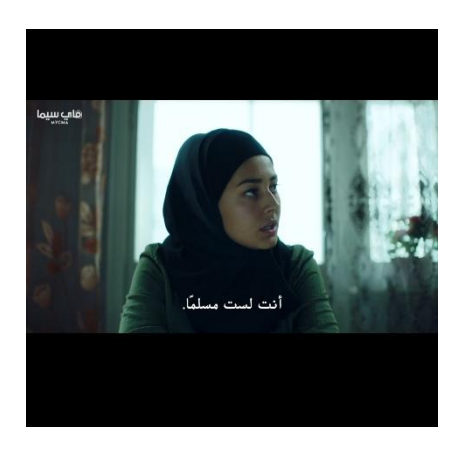
Screen Capture (3): "Caliphate", episode 4, min 14.33