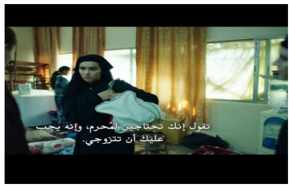
Screen Capture (1): "Caliphate", episode 7, min 18.06

Apparently, the theme of women's rights is so prominent in Netflix's Caliphate . ISIS is depicted as being an extremely radical terrorist group whose ideology is based on discriminating and suppressing women. This part analyzes encoding/decoding of the theme of women discrimination in Caliphate . Each scene is analyzed semiotically and discursively to cover the paralinguistic features as well as the linguistic/discursive ones.