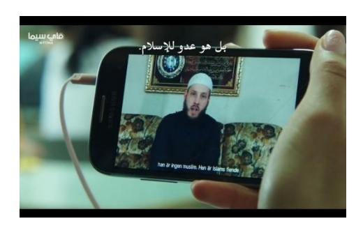
Screen Capture (8): "Caliphate", episode 2, min 12.41