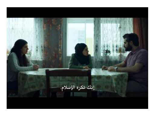
Screen Capture (4): "Caliphate", episode 4, min 14.37