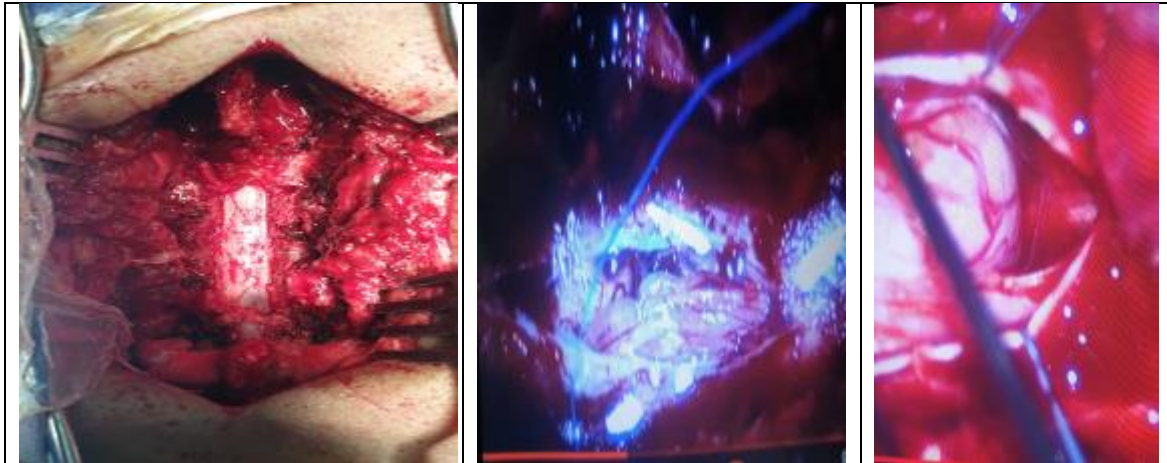
Figure (1): Intraoperative neuromonitoring of spinal Intradural lesions.

The extent of resection was determined by intraoperative microscopic inspection of the tumor bed, and confirmed by postoperative MRI examination ( Figure 2 ).