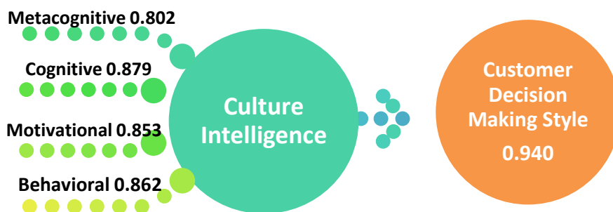
Figure 2: Effect of Culture Intelligence on Customer Decision Making Style

Source: (prepared by the researcher based on statistical analysis)