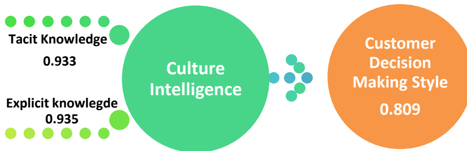
Figure 3: Effect of Culture Intelligence on Customer Decision Making Style