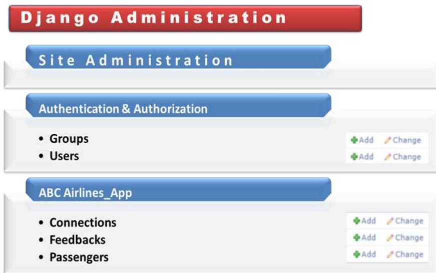
Figure 3 Admin view