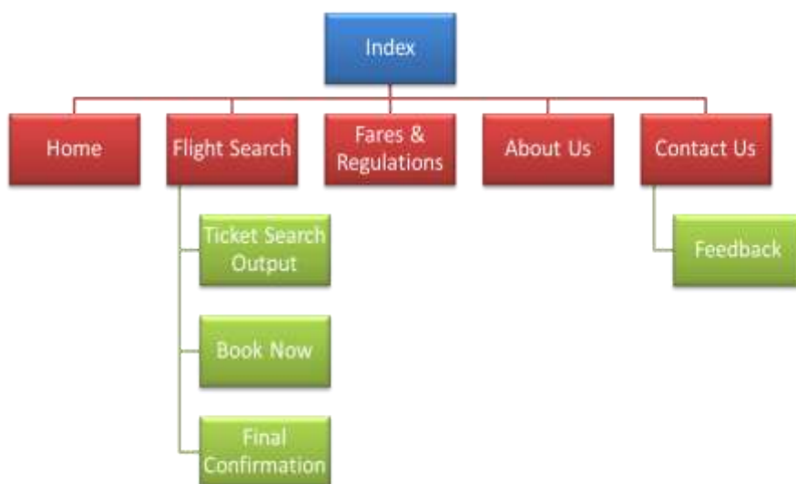
Figure 1 Web pages and subpages

about the organization, and connections to different subpages. Also, pages 'About' and 'Contact' hold the data about the organization and contact points of interest individually. In 'Contact' page, the client can influence utilization of the criticism to frame to send message to the organization. In 'Admissions and directions' page, the client can discover data about the strategies of the organization with respect to tolls and controls. There is 'Flight Search' page from which the client can seek flights and continue to reserve a spot. But 'Contact' and 'Flight Search' pages, the staying three principle pages are static. Diagram 1 demonstrates the fundamental website pages and sub-pages of the application (Wale, 2010).