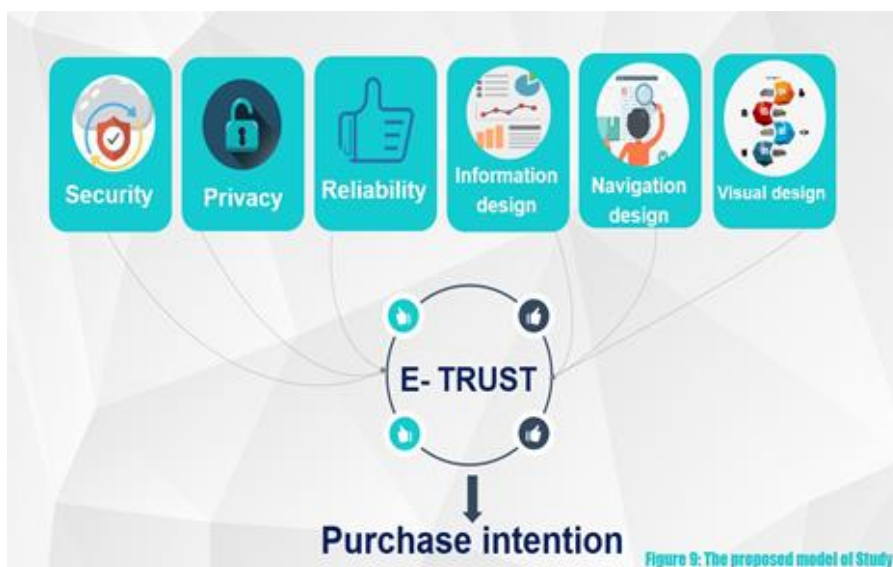
Figure 1 Structural Equation Modeling of study using AMOS

Chi Square= 6.37, df = 4, P. = 0.173 (non-significant), NFI=0.99, CFI=0.99, TLI=0.99, RMSEA= 0.05