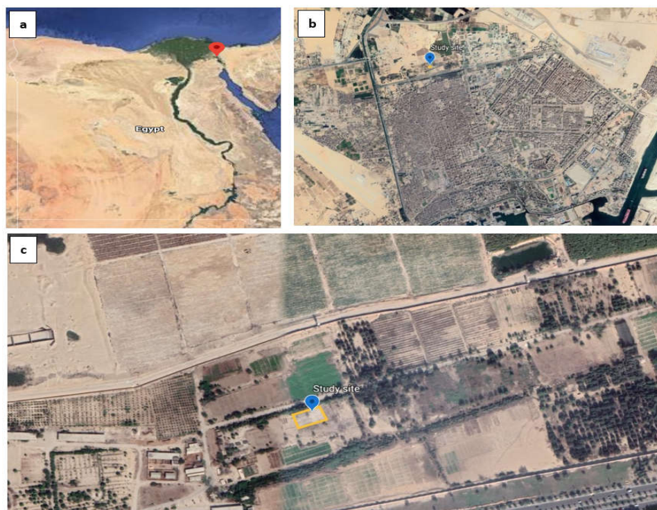
Fig. (1): Location of the study site in Egypt (a) located in Ismailia Governorate (b) at the experimental farm of Faculty of Agriculture, Suez Canal University (c)

The experimental work of this study was conducted in the experimental farm (30° 37' N, 32° 15' E) of the Faculty of Agriculture, Suez Canal University, Ismailia, Egypt (Fig. 1) during two consecutive seasons (2017 and 2018). The experimental site is virgin and has not been cultivated before and it was a sandy soil in texture. Soil samples were collected from the site (5 replicates), air-dried, crushed, sieved through a 2 mm sieve, and analyzed for some major properties. The initial determined properties of the soil in terms of sand %, silt %, clay %, pH, EC were shown in Table (1).