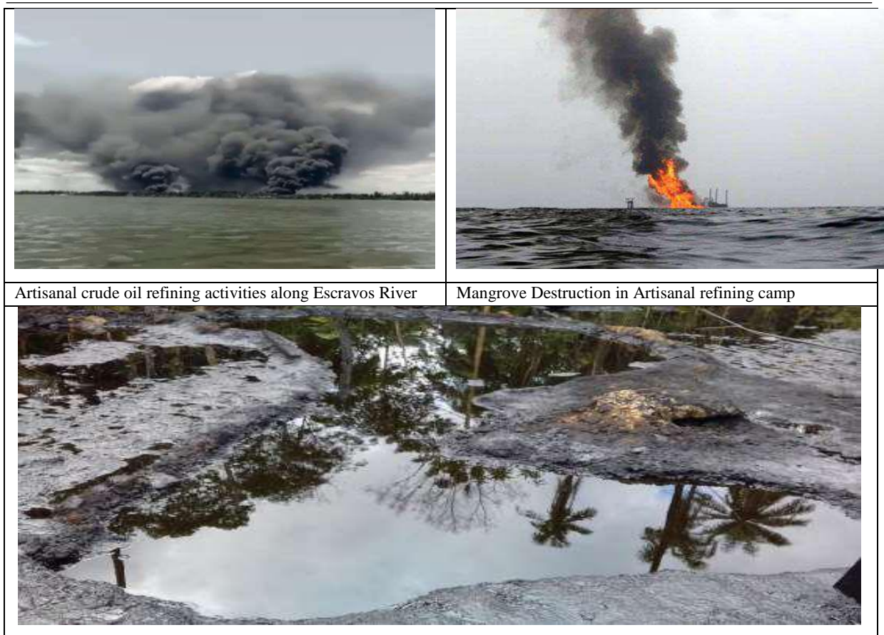
Artisanal crude oil refining activities along Escravos River