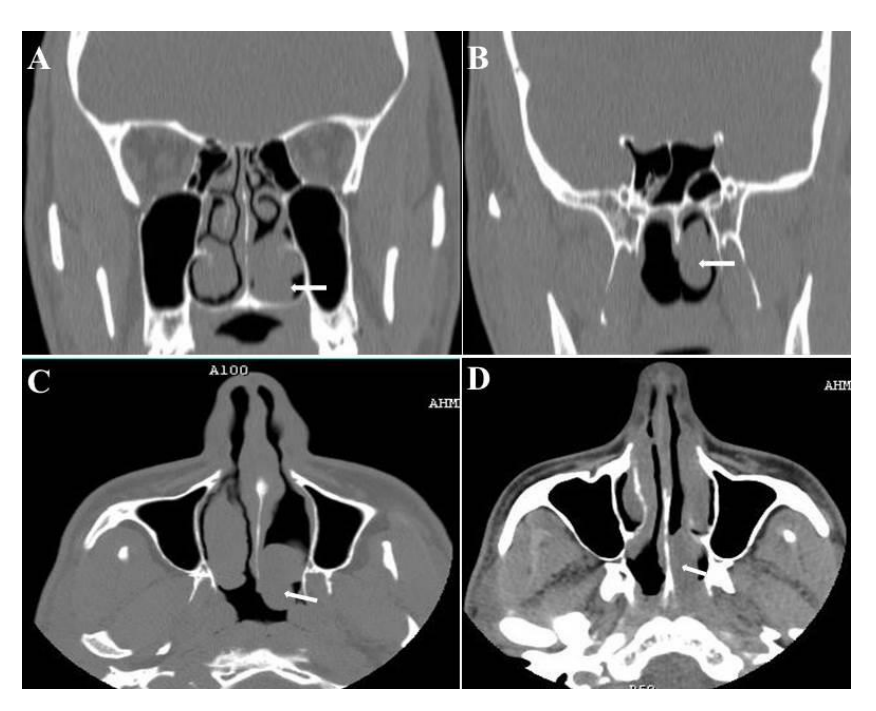
Figure 4 : CT scan with coronal (A, B), axial (C) bone window cuts, and axial soft tissue cut (D) showing a soft tissue density mass arising from the posterior end of the inferior turbinate, and extending through the right choana into the nasopharynx (white arrows).