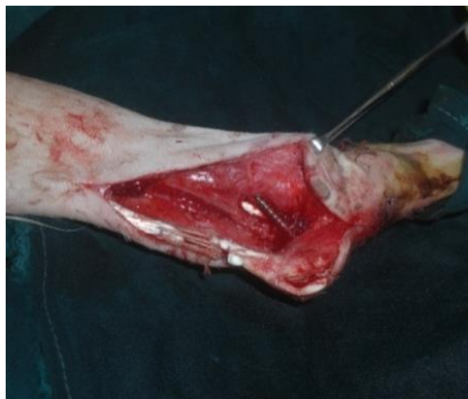
Figure 2: Showing application of screw with tenorrhaphy of right hind limb with locking loop suture pattern using nylon only (Group I).

group I and II. Thickening without tenderness was seen in group III. Landing the ground by the toe with severe lameness was evident in group III. Light degree of lameness was recorded in group III. The gliding movement of the tendon under the skin was palpable in group II and III but in group II tight adhesion of the tendon defect with the skin was still present. Twelve weeks post operation, animals walked normally without hyper extension or hyper flexion of the hock joint of the operated limb in group II and III. Light degree of lameness was recorded in all animals of group I. The repaired defect was thicker than remaining normal tendon in group II followed by group I. The gliding movement of tendon was normal without adhesion with the skin in group II and III. Skin adhesion with the repaired defect was still present in all animals of group I.