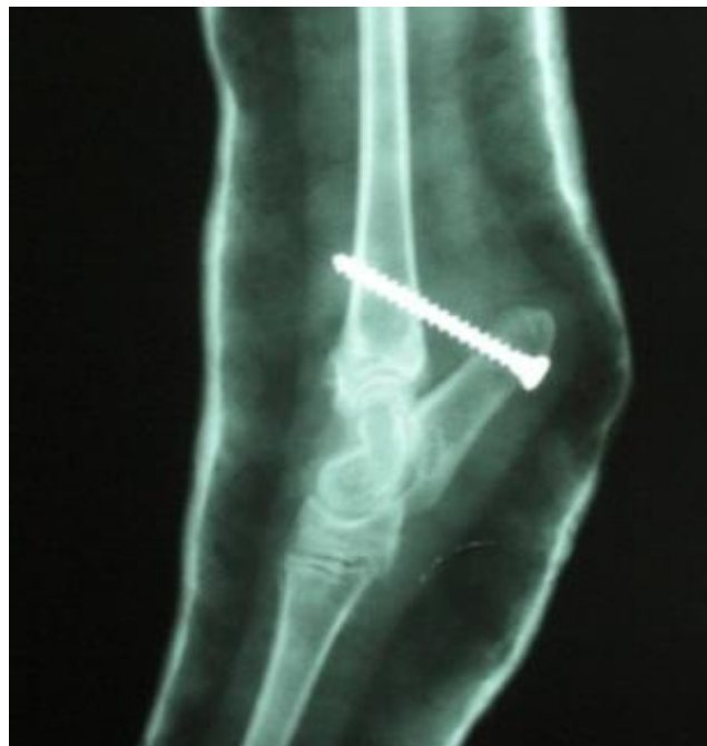
Figure 3: Showing x ray film to confirm the presence of the cortical screw in tibiotalar articulation for immobilization.

internal structure of the tendon still not clearly defined. Severe adhesions represented by hyperechogenicity of the tendon with the peritendinous tissue. The abnormal tendon thickness increasing began to decrease but still thickened than normal (Fig.4d). The sonogram showed nearly normal mottled hypoechoic to hyperechoic tendon texture, with moderate adhesions and less thickening than normal, at the 12 th postoperative week (Fig.4 g).