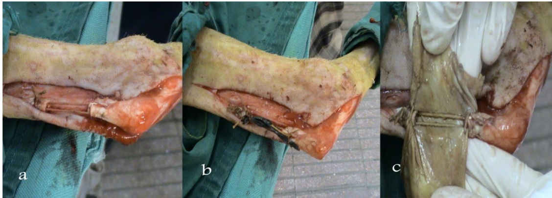
Figure 1: Showing suturing the common calcaneal tendon of right hind limb with locking loop suture pattern using nylon only a, (Group I), nylon with carbon fiber b. (Group II), and nylon with pericardial flap c (Group III).