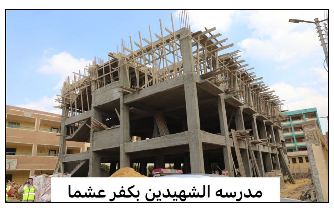
Figure 4. A partial replacement in Alshaheedain Basic Education School, Kafr Ashma