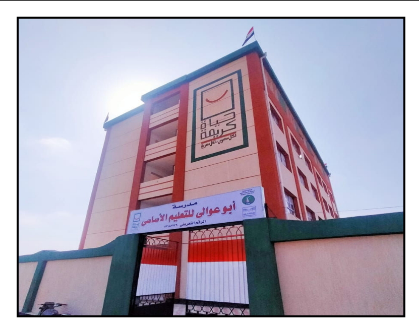
Figure 2. Abu Awali School for Basic Education