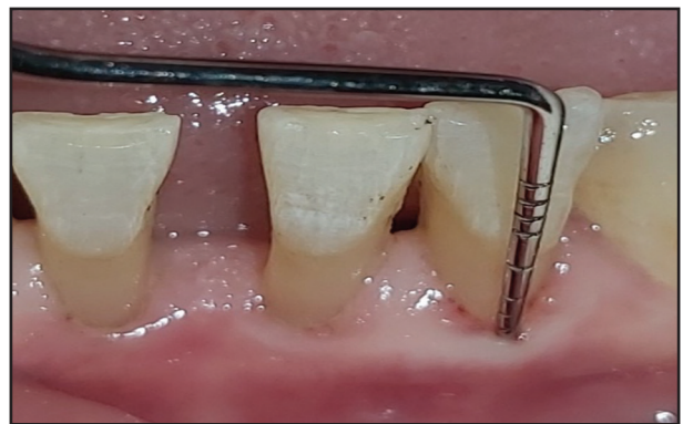
Figure (1) Clinical photograph showing 6mm clinical attachment loss