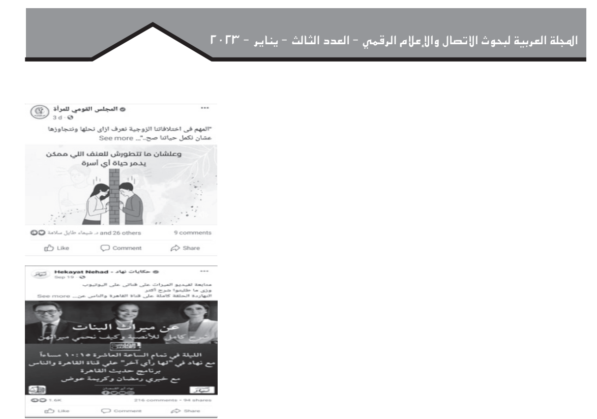
Photo from hekayat nehad page on women's rights. Photos from the NCW page on women's rights