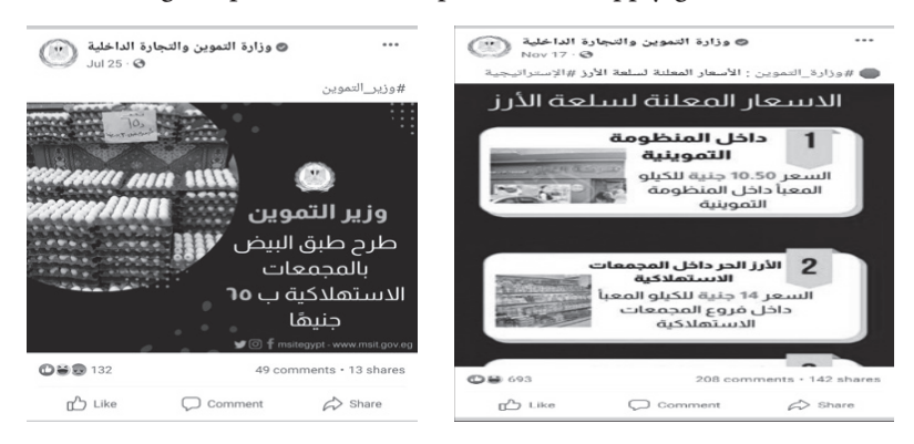
Photos from Ministry of Supply and Internal Trade page on citizenship

• informing the public about the price of the supply goods at this time