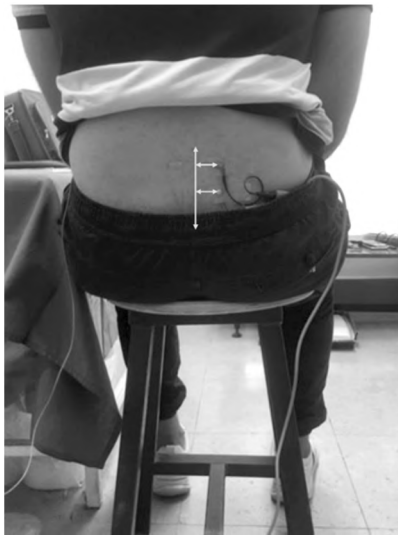
Fig. (1): Placement of EMG surface electrodes.

structed to extend their lumbar area outward in the lordotic position, also they were instructed to stretch their lumbar area inward to assume the kyphotic position. The participants maintained constant foot stance postures throughout the test by maintaining their thighs horizontal, knees in a comfortable position, arms hanging freely, and feet shoulder-width apart [14].