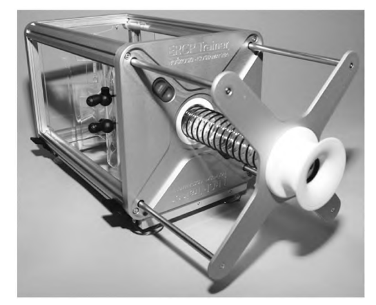
Fig. (1): The Boŝkoski-Costamagna ERCP Trainer [5].

• Model definition: The model is a useful tool for ERCP training, particularly in improving the position of the scope, handling the wheels and the elevator, targeting the papilla, selectively cannulating the biliary and pancreatic ducts, extracting stones, and placing plastic and metal stents.