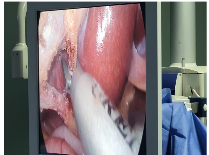
Figure (2) clipping of cystic artery

Four port technique: The ports on the anterior axillary line of the right flank received a fifth 5mm port. In order to assist in the dissection of the Calot's triangle and provide the gall bladder traction, this was employed to grab the fundus of the gall bladder. The final steps were conducted in a manner similar to that of the three-port approach. Figure (2)