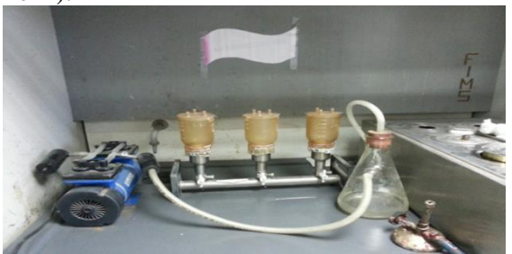
Fig. (5): Membrane filter technique.

The method membrane filter (M.F) is based on the filtration of known volume of water sample through a membrane filter consists of a cellulose compound with uniform pore diameter of 0.45 micron, the bacteria are remained on the surface of filter paper for (clarified, filtrate stages and tap water) as shown in (Figure 5). When the membrane containing the bacteria is incubated in a sterile container at appropriate temperature with a selective media, colonies of coliform are counted directly (WHO, 2004 and Gautam, 2014).