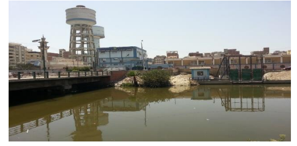
Fig. (4): Bahr Mowees (Raw water) and Zagazig Drinking Water Treatment Plant (Prechlorinated and postchlorinated water )in Zagazig city.

dissolved solids (TDS). Chemical parameters are chloride (Cl-), total alkalinity, total magnesium hardness, hardness, calcium hardness and residual chlorine. Both parameters were determined according to (APHA, 2005 ).Bacterial methods