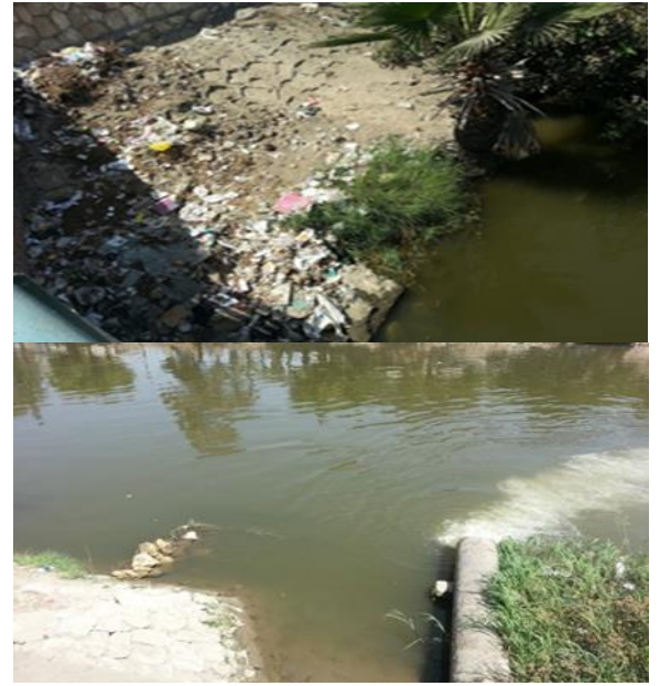
Fig. (2 and 3): Contamination of Bahr Mowees in Zagazig city.