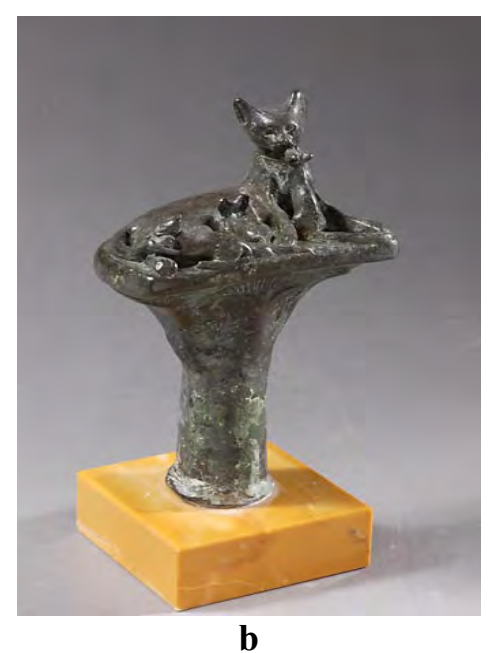
Pl. 2 Bastet divine standard at Louvre Museum www.louvre.fr/en/oeuvre-notices/divine-standard