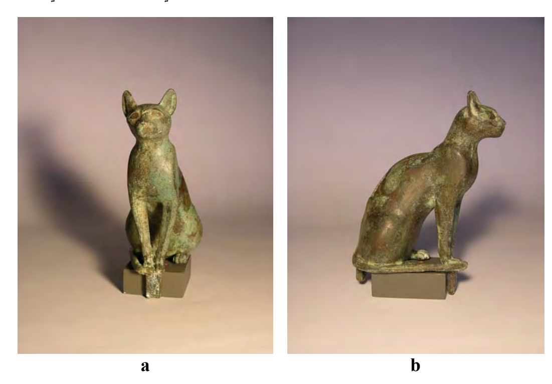
Pl. 1 Bastet Bronze Statue at Zagazig University Museum