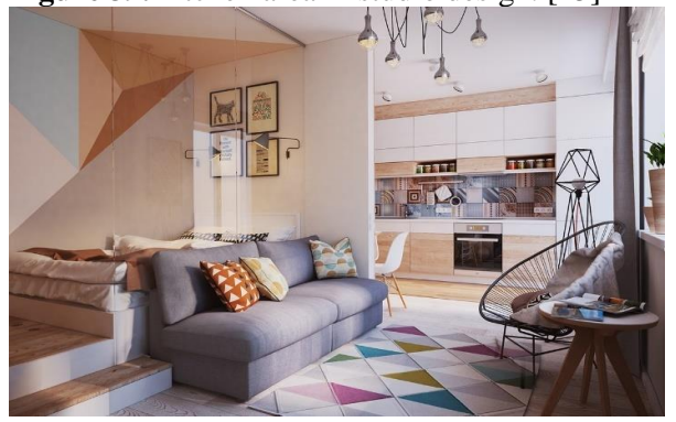
Figure 40. Bedroom and living spaces in studio design. [16]