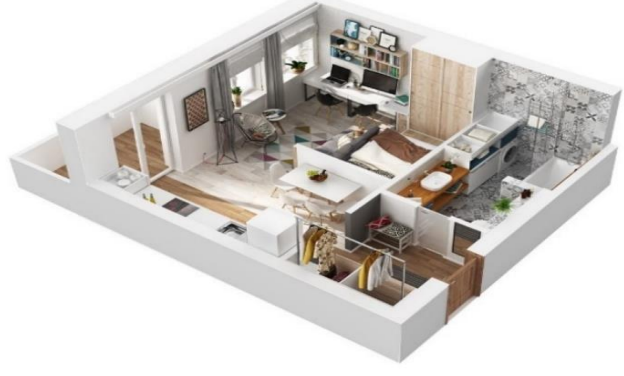
Figure 37. Studio design in a 40-square-meter area. [25]