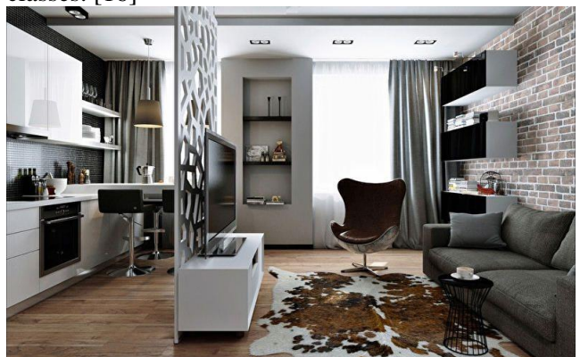
Figure 13. The studio's interior design is straightforward.[16]

The studio apartment appeals to music lovers and creative people. [16] Studio apartments are not appropriate for large families or families with multiple generations. Studios are a popular vacation destination. As a result, this apartment is the best option for living in the resort. Furthermore, the purchase of such real estate is a good investment because studio apartments are always in high demand among vacationers of all ages and social classes. [16]