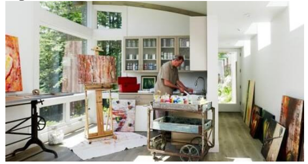
Figure 19. Interaction in the design of the artist's studio. [22]