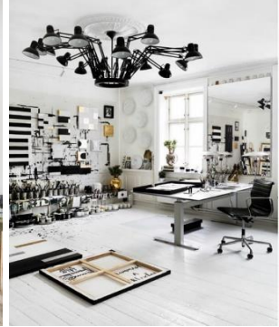
Figure 25. The artist's studio's design stimulates the artist's inspiration. [22]