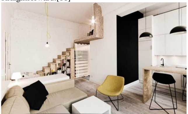
Figure 14. The studio's interior design. [17]