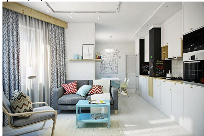
Figure 83. Minimalist style in the studio. [16] 12. The advantages of a studio apartment