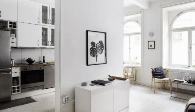
Figure 67. The designer used black and white, which are ideal colors for the studio. [17]