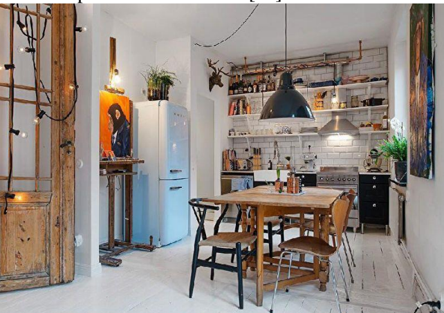
Figure 78. Scandinavian Style in the studio. [16] 11.3 Studio Apartment in Classic Style

The Scandinavian style is ideal for any type of studio apartment. Typically, the walls are painted white. If the room is small, this works perfectly. Furniture should be functional. As a result, if the studio is large, the designer can select non-standard sofas and complement them with armchairs, sofas, or other upholstered furniture. [16]