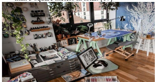
Figure 45. Furniture in an artist's studio. [22]