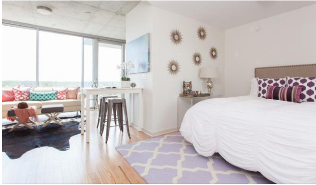
Figure 53. The studio benefits from natural light thanks to its large windows. [16]