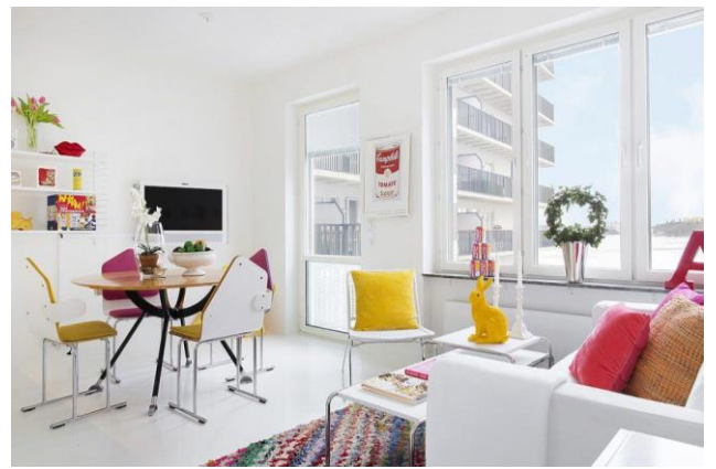
Figure 65. The use of bold colors in a studio apartment. [17]