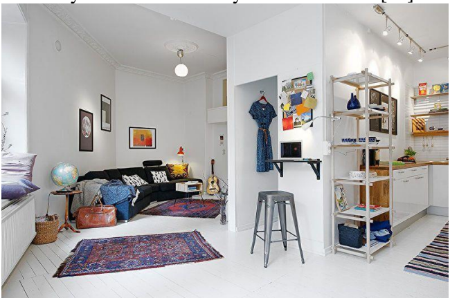
Figure 74. Lifestyle concept in studio design. [16]

Accommodation for bachelors, young couples, and families with young children should be completely different. If there is a child in the family, it is necessary to ensure the safety of the situation. [16]