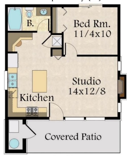
Figure 15. Floor Plan for Lombard Studio Furniture. The studio design is a combination of functional and modern living. It is entered through a cozy covered patio, with the living room and kitchen to the left. The kitchen is far more functional than kitchens in other small modern home plans in this size range. A small office for working from home is located in the far corner of the kitchen. The living room itself has plenty of comfortable seating as well as a fireplace. The bedroom is located in the plan's back right corner. [19]

the artist's needs and personality. [14]