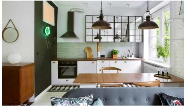
Figure 69. kitchen in a light-filled apartment with dark-colored furnishings. [17]