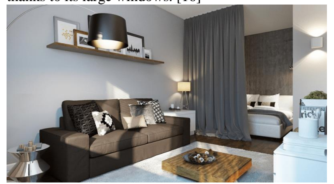
Figure 54. Curtains to separate bedroom space in the studio. [16]