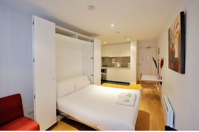
Figure 75. Bed mechanism to save space. [16] Some styles are most often used for the design of studio apartments, such as: