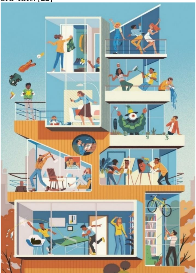
Figure 27. A diagram of the interior design of artists' studio spaces for all creative people. [24]