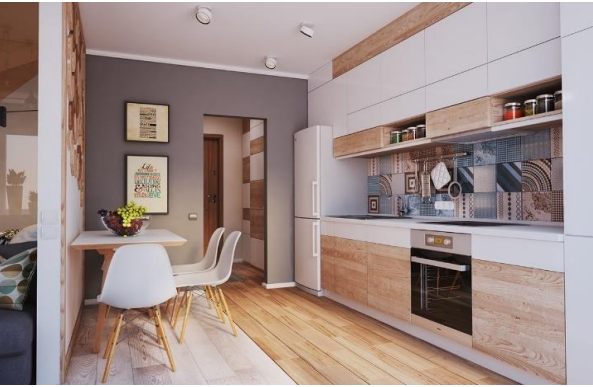
Figure 39. kitchen area in studio design. [25]