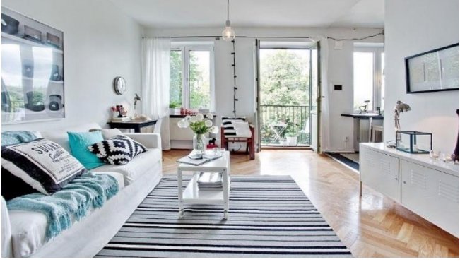
Figure 62. The white monochrome interior is designed with brightly colored elements. [16]