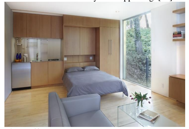
Figure 48. Small and comfortable studio apartment. [16]

The studio's furniture should be functional. Modular furniture or multifunctional furniture is a better use of space. Mirrors, glass, and other glossy surfaces are used to visually expand the studio apartment. Stretch ceilings, glossy kitchen set fronts, glass tables with chrome legs, sliding-door wardrobes with mirror panels, and mirror installation on the walls are just a few inexpensive and effective ways to make the studio visually more appealing. [16]