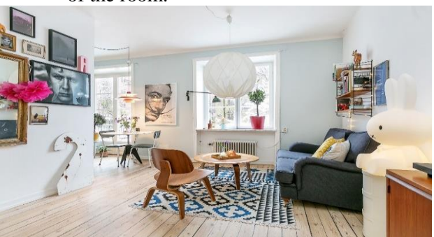
Figure 41. Square zoning in studio design. [16]