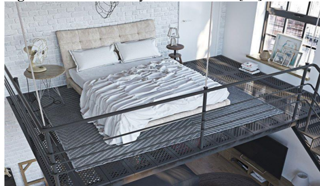
Figure 81. Industrial bedroom in the studio. [16] 11.5 Studio Apartment in Minimalist Style

The minimalism style allows studio homes to be furnished with only what is truly necessary for daily life. Furniture typically has narrow shapes and few finishing elements. The use of contrasting colors will contribute to the dynamism of the studio apartment design. Black and white are frequently used for this, or bright summer colors are added to the interior. The studio will not be overburdened, although the owner will have a free and spacious view. [16]