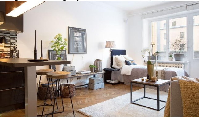
Figure 63. The interior design of a studio apartment is in white colors. [16]