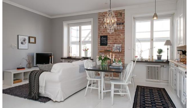
Figure 43. The brick wall visually separates the cozy living room from the bright kitchen. [16] Furniture can be placed anywhere in the room, including in the center if a rest area is required. There are also studio apartments of 19.4 square meters with a kitchen and bathroom. Convertible and multifunctional furniture are the best options for studios and one-room apartments. It saves a lot of space. A small studio apartment becomes an ideal starting point for many young people and even married couples. Designers provide hundreds of options for creating stylish and comfortable housing in studio apartments. [16]