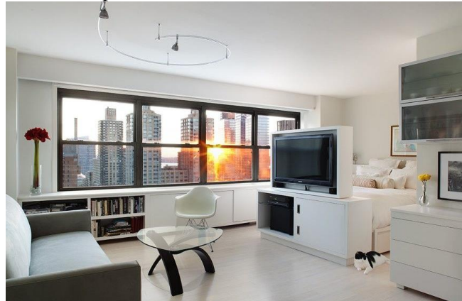
Figure 71. Modern finishing materials were used in the studio. [16]

The use of various finishing materials in the kitchen, living room, and bedroom is very important. For instance, tiles in the kitchen and laminate in the living room. Simultaneously, it is critical to maintain harmony and balance: different types of materials must correspond to color or texture. [16]