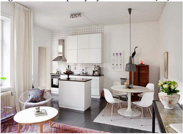
Figure 77. Modern style in the studio. [16] 11.2 Studio Apartment in Scandinavian Style

The Scandinavian style is ideal for any type of studio apartment. Typically, the walls are painted white. If the room is small, this works perfectly. Furniture should be functional. As a result, if the studio is large, the designer can select non-standard sofas and complement them with armchairs, sofas, or other upholstered furniture. [16]