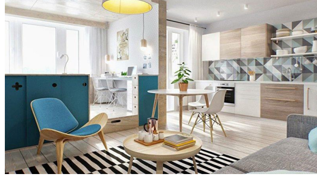
Figure 64. Bright colors in studio design. [16]