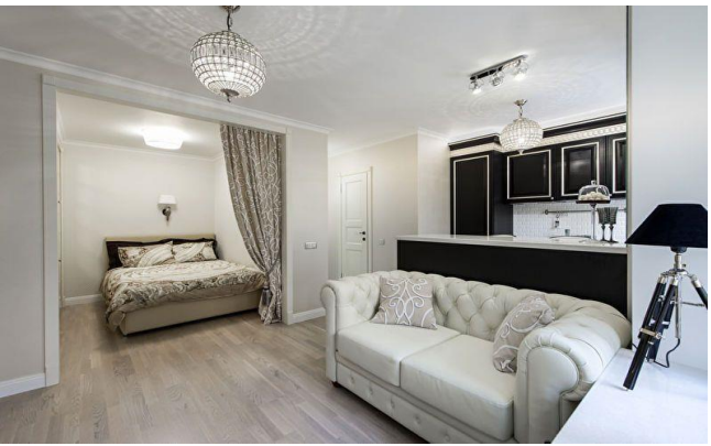
Figure 79. Classic style in the studio. [16] 11.4 Studio Apartment in Industrial Style

The classic style is best suited for large rooms. It looks especially nice in older homes with high ceilings. Patterns can be made more noticeable with stucco or other distinctive finishes. [16]