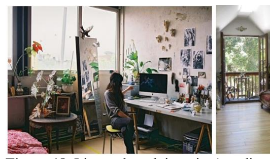
Figure 18. Live and work in artists' studios. [22]