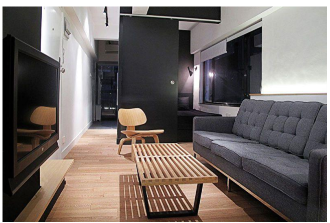
Figure 82. Planning functional areas in a studio apartment should allow for comfort in a single living space. [16]