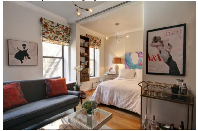
Figure 44. A small studio apartment. [16] 9. The placement of furniture

There are many options for placing furniture in the studio. The first option involves the use of a partition, in this case, a studio apartment of 20 square meters. It will have a design in which several separate zones in the room are formed. As a result, the areas for sleeping and living are divided among