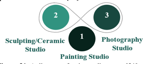
Figure 31. A diagram of artist studio types. [21]

There are many different types of artist studios, such as painting studios, sculpture studios, ceramics studios, photography studios, and others, each with its design standards and requirements. Each studio type has its own set of activities which are both specific and functional. [21]