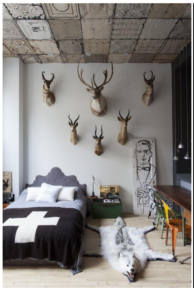
Figure 52. Comfortable bedroom design in a studio. [16]