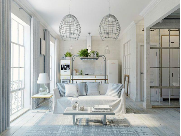
Figure 51. Studio apartment design. [16] 9.4 The Design of a Bedroom in Studio

The bedroom is one of the most important rooms in the apartment and should be as comfortable as possible. Everyone's needs are different in this situation. It is sufficient for a single person to place only a sleeping sofa. Someone needs a sofa and a bed, as well as someone else who needs a baby cot next to them. Most owners have a separate bed, which can be separated from the common area. Partitions of various types can be used for this, including plasterboard or wooden structures, glass limiters, blinds, wardrobes, and sliding doors. [16] The bedroom area in a studio is in a small space or loft space. Another advantage of the studio is the freedom to be creative. Designers can select any studio apartment to create a unique living space that is complemented by unique features. The rooms in a studio apartment have no boundaries, making them appear larger. Every studio apartment is a functional room because every meter of living space is free. All the rooms are combined in the studio apartment, and the bedroom can be hidden behind the curtains.