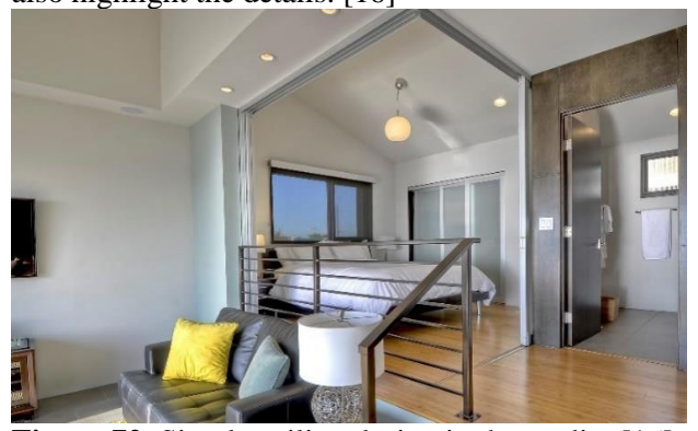
Figure 72. Simple ceiling design in the studio. [16]

Ceiling variations can be an excellent way to zone the studio. Plasterboard multi-level ceiling structures not only separate the kitchen and living room but also highlight the details. [16]