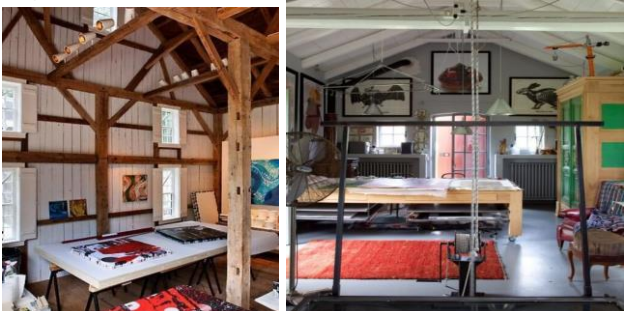
Figure 46. Artist's studio furniture design. [22]