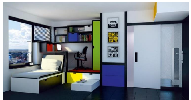
Figure 61. The project is a small studio for a young man. The living space is 22 square meters. The bed has large boxes for storage, and the desk is on a pedestal. Allowing rationally allows for the organization of unused space. The use of vibrant color details against a backdrop of white walls creates a fashionable, modern, and dynamic interior. [17]