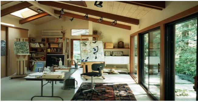
Figure 29. Creative artists' studio. [22] 6.5 Studio space design elements

To create a cultural environment in which artists can work and live, the artist should be provided with a space to interact. The studio includes space for artists as well as an open space with many functions. Artists will be able to work and live in a variety of environments. [21]