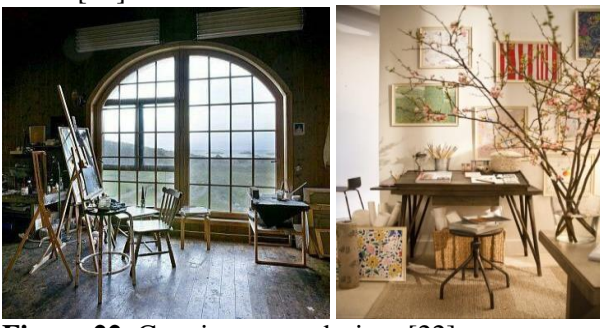
Figure 22. Creative space design. [22]