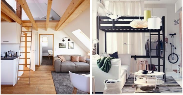
Figure 56. The bedroom in the mezzanine. [16] This solution is only possible if the ceilings are high. The studio's interior design emphasizes a modern finish. In small apartments, additional surfaces are frequently purchased with the addition of a mezzanine. [17]

Designers struggled with the interior design of the studio. The bedroom is usually located on the mezzanine.