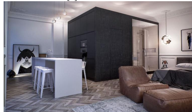
Figure 16. Bedroom and study area in the studio. [16]

Studio apartments, which save space, are known by other names all over the world. In Canada, it is called "Bachelor Apartment" or "Bachelor". In the United States, it is called a "Studio Apartment" or "Alcove Studio." [1]