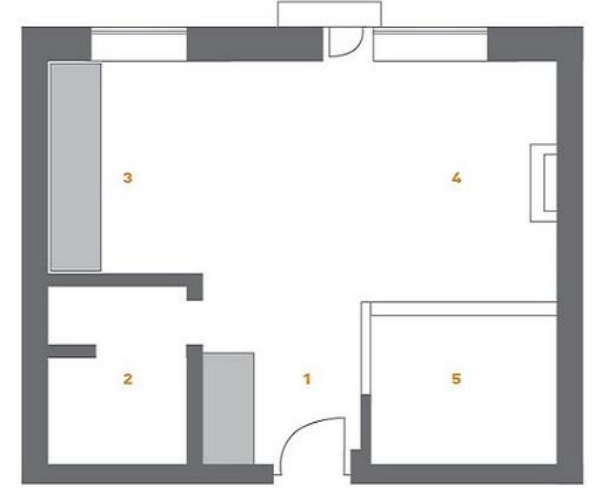
Figure 35. Floor plan of studio design in the planning process. [16]

The purchase of a 20-square-meter studio has