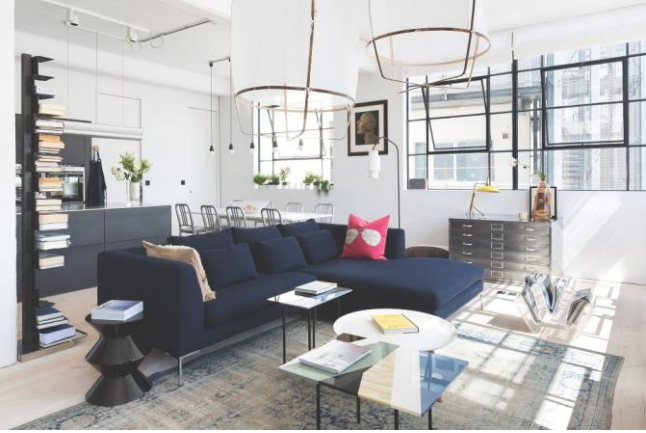
Figure 70. Functional lighting in the studio. [16] 10.3 Materials in the Studio

Bright lights and numerous light sources are typically used in active areas of the studio, such as chandeliers and point lights, although in the entertainment area or bedroom, scattered and soft light from one or two wall sconces is sufficient. This method allows the artist to highlight areas of the studio and concentrate on the most important details. [16]