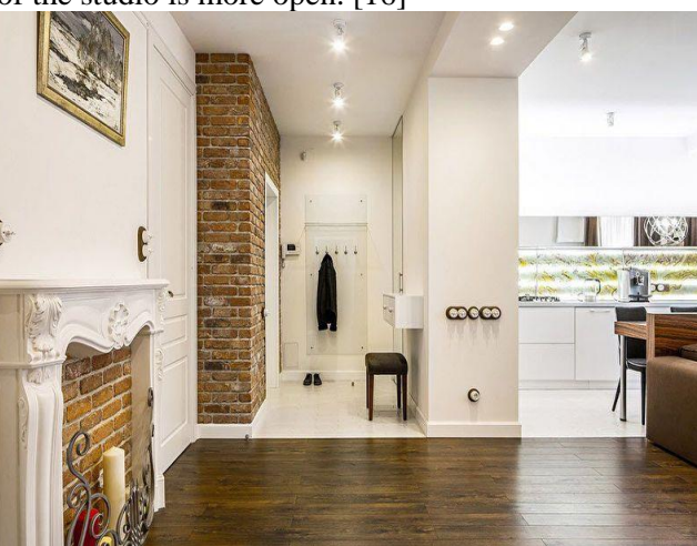
Figure 50. Studio hallway design. [16]

If there is enough space in the hall, a large built-in wardrobe is an excellent option. As a result, the rest of the studio is more open. [16]