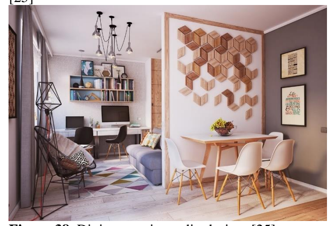
Figure 38. Dining area in studio design. [25]