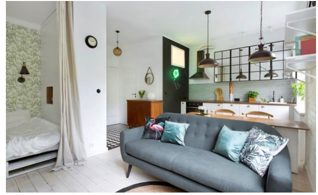
Figure 68. Disclosures are the best choice for an apartment with this layout because they make the space feel lighter and airier. [17]