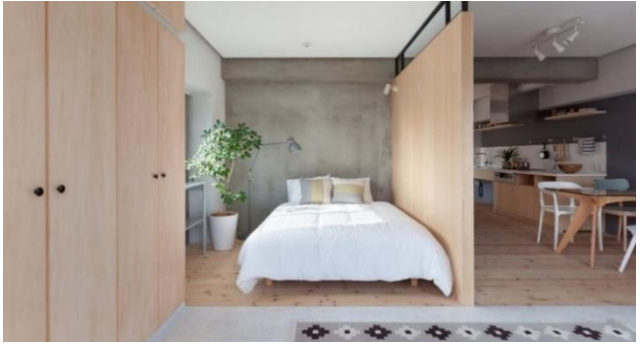
Figure 55. The bedroom area is separated from the studio. [16]