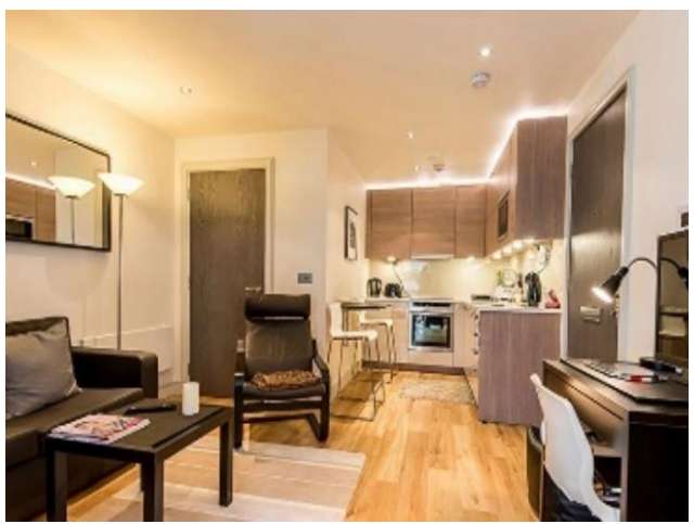
Figure 76. Contemporary style in the studio. [16]