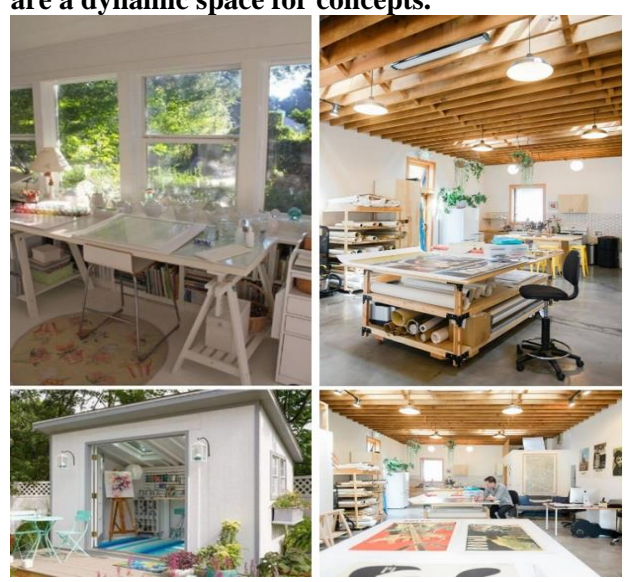
Figure 17. Artist's studio design.[22]

The spaces we encounter daily are extensions of societal needs. spaces are designed in response to culture to stimulate new events and movement through a live and work studio. Artists and communities can move and interact. [21] The creative professions which fit into these spaces are a dynamic space for concepts.