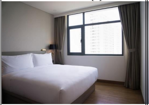
Figure 8. The interior design of a onebedroom apartment. [13]

A two-bedroom apartment has two bedrooms that are designed to be private. These apartments are common in major cities and are typically twobedroom suites. In this two-bedroom layout, each bedroom is on opposite sides of the apartment, with a common area in the center that includes the living room, kitchen, and dining area. This type of apartment is the most popular among tenants, resulting in a roommate to share expenses. [13]