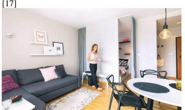
Figure 33. All functions are in a studio