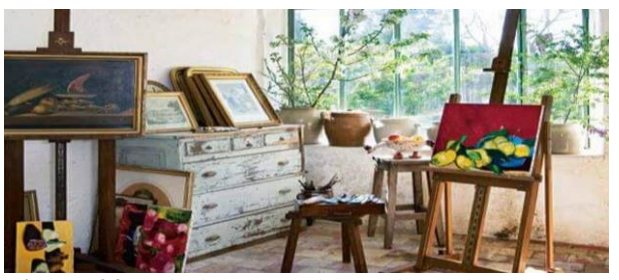
Figure 23. Painting space in studio design. [22] 6.3 List of Artistic and Creative Professions

Accessory Designer Advertising Designer Art administrator