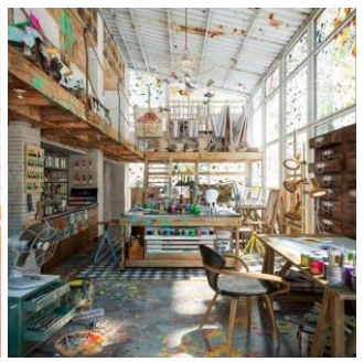
Figure 26. Space design is a creative profession for