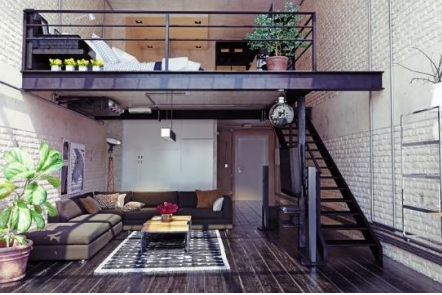
Figure 11. The bedroom area is in the loft space. [13]