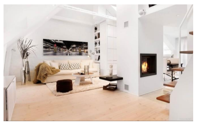
Figure 42. Rectangular zoning in studio design. [16]