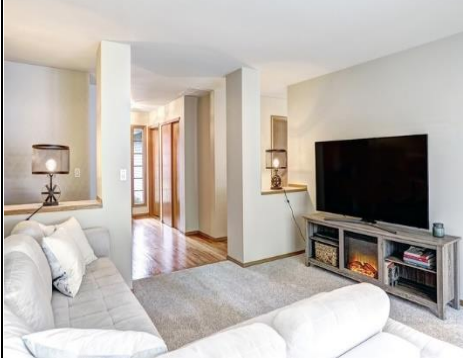
Figure 9. The interior design of a twobedroom apartment. [13]