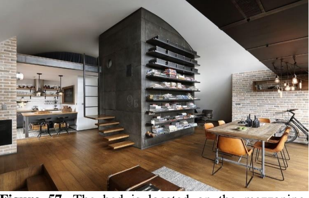
Figure 57. The bed is located on the mezzanine above the kitchenette to save space. [16]