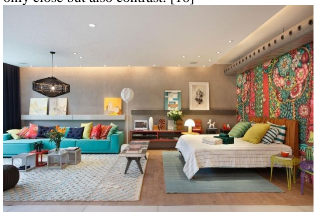
Figure 60. Bright colors in studio design. [16]

Small studio apartments should be decorated in light colors. The ceiling and walls are frequently painted in the same color, which visually expands the space. Dark colors are permitted in large rooms, although they should be used in conjunction with a contrasting light color to maintain the balance and not visually shrink the area. On the other hand, designers may purposefully recommend deep, saturated tones to achieve a specific effect in the interior. Designers can use wallpaper to cover one of the walls. If the area is small, a small pattern in neutral tones is preferable. A large, bright figure draws a lot of attention and visually shrinks the room. In in-studio apartments, the perfect choice is always a white ceiling. It can be just a painted surface or a hanging system. If the room has high ceilings, this gives more freedom to work. Designers recommend not being afraid of the unknown and experimenting with color combinations that are not only close but also contrast. [16]