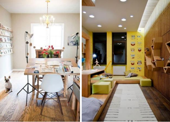
Figure 20. Dynamic space for artists' studios. [22]