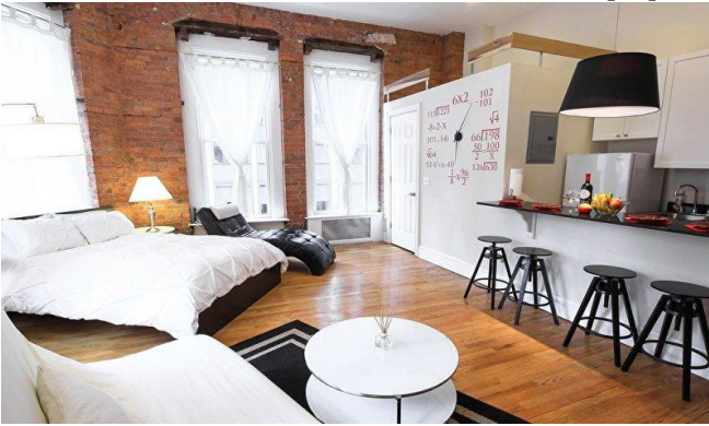
Figure 80. Industrial style in the studio. [16]

The studio is an excellent choice for a city dweller who appreciates industrial decor elements. Originally, the industrial style was used to repair industrial shops. Therefore, it will be more interesting to look at similar, previously unoccupied premises or at apartments in old houses which have been converted into studios due to redevelopment. Older homes typically have higher ceilings, allowing for the creation of a second level in the studio. [16]