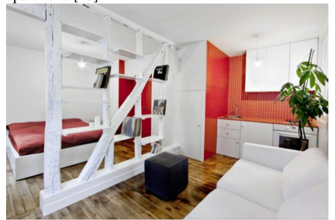
Figure 66. A powerful color palette for a studio. [17]