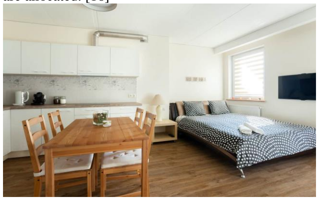
Figure 34. The studio is divided into two sections: the sleeping area and the living room. Kitchen space is frequently increased by narrowing the hallway. [17]

A studio apartment has a living space, a bed space, a kitchen, and a shower space all in one elegant and compact space. [1] The studio apartment appears to be a box containing everything an artist would require to live. There are sometimes partial walls or alcoves to provide visual contrast and a slight separation between the various areas. The bathroom is the only room in the studio that is completely enclosed. [14] The layout of the studio apartment is characterized by freedom of style, space, and the absence of any boundaries. Most often, in the planning process in the studio, the areas of food preparation, dining, entertainment, and workspace are allocated. [16]