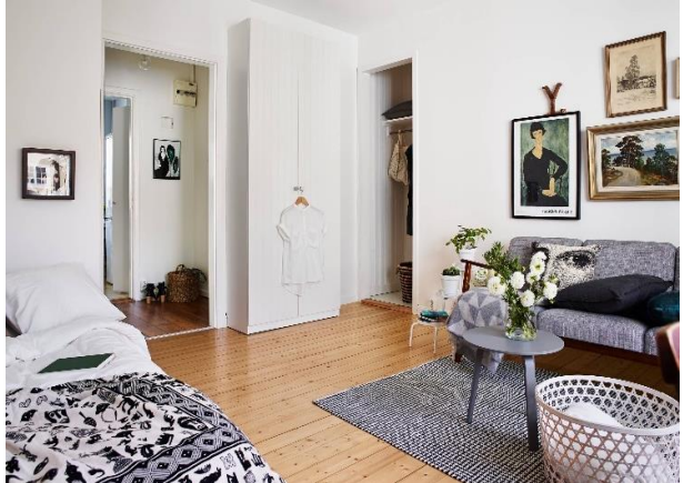
Figure 49. A bright and spacious studio. [16]