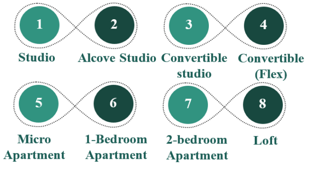
Figure 1. A diagram of types of small apartments. [8]

Therefore, the research will study the following terms, which are some common terms for different types of small apartments: