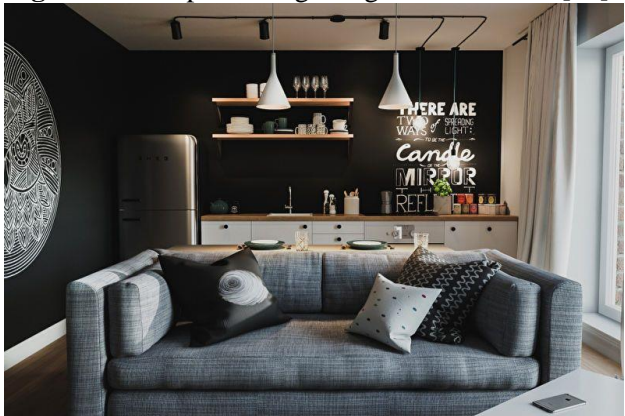
Figure 73. The ceiling and walls are in contrast. 11. Style in the Studio

The most common styles chosen by studios are reserved for minimalism or hi-tech. They allow the designer to make the space not only fashionable and appealing but also comfortable. However, designers can use elements of other styles in a specific direction, such as complementing the room with an Art Nouveau chandelier or placing a cozy country sofa in the living room. Mixing styles is one option for revitalizing the studio interior. This method is accessible to make the studio truly unique.