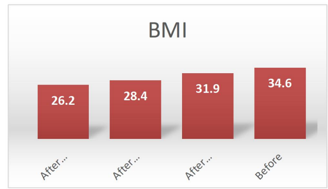
Figure two sketches the mean Body Mass Index (BMI) among study participants before and 1,2&3 years after bariatric surgery. The figure shows that the mean BMI before surgery was 34.6, with a standard deviation of 3.1.

The mean BMI decreased over time among participants 31.9±SD 2.8, 28.4± SD 2.9 & 26.2± SD 2.8 after one, two, and 3 years respectively. Noting that time since surgery differs among study participants.